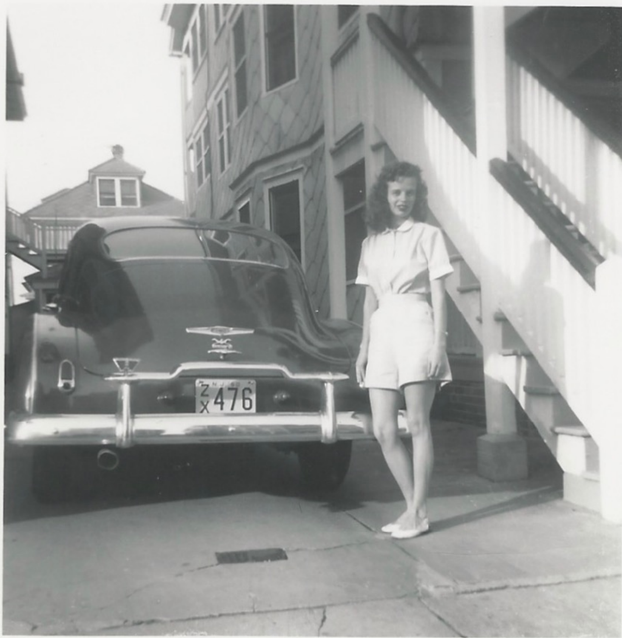
3.5"x3.5" - $10