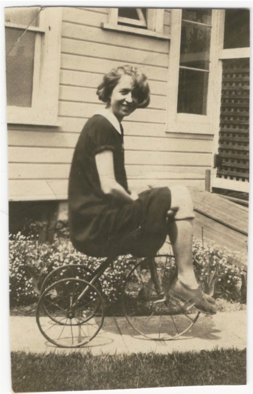
2"x3.25" - $10