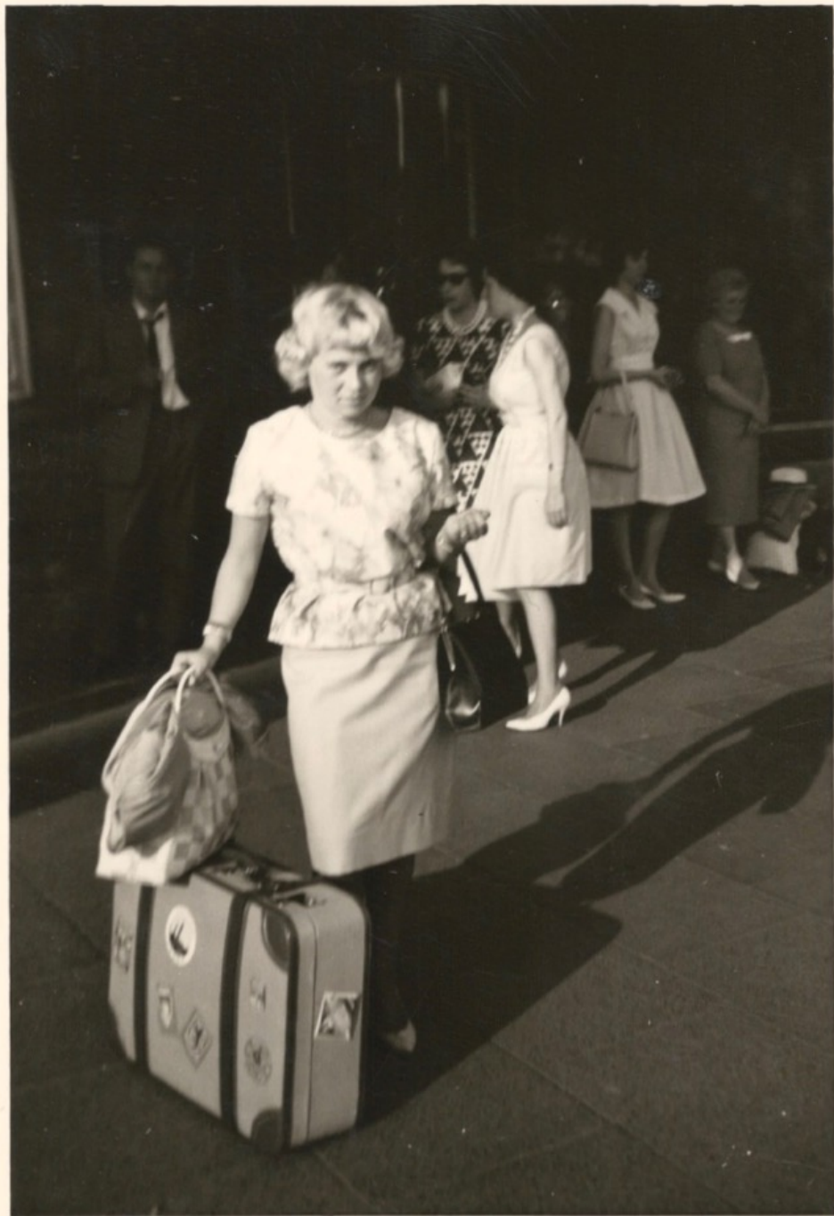
2.75"x4" - $10