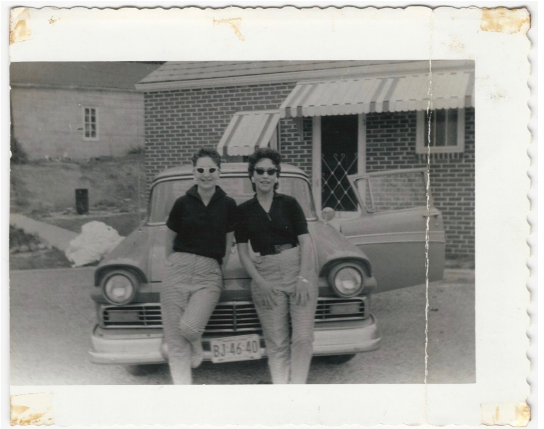
4.5"x3.25" - $10