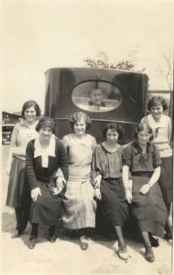
3.5"x5" - $10