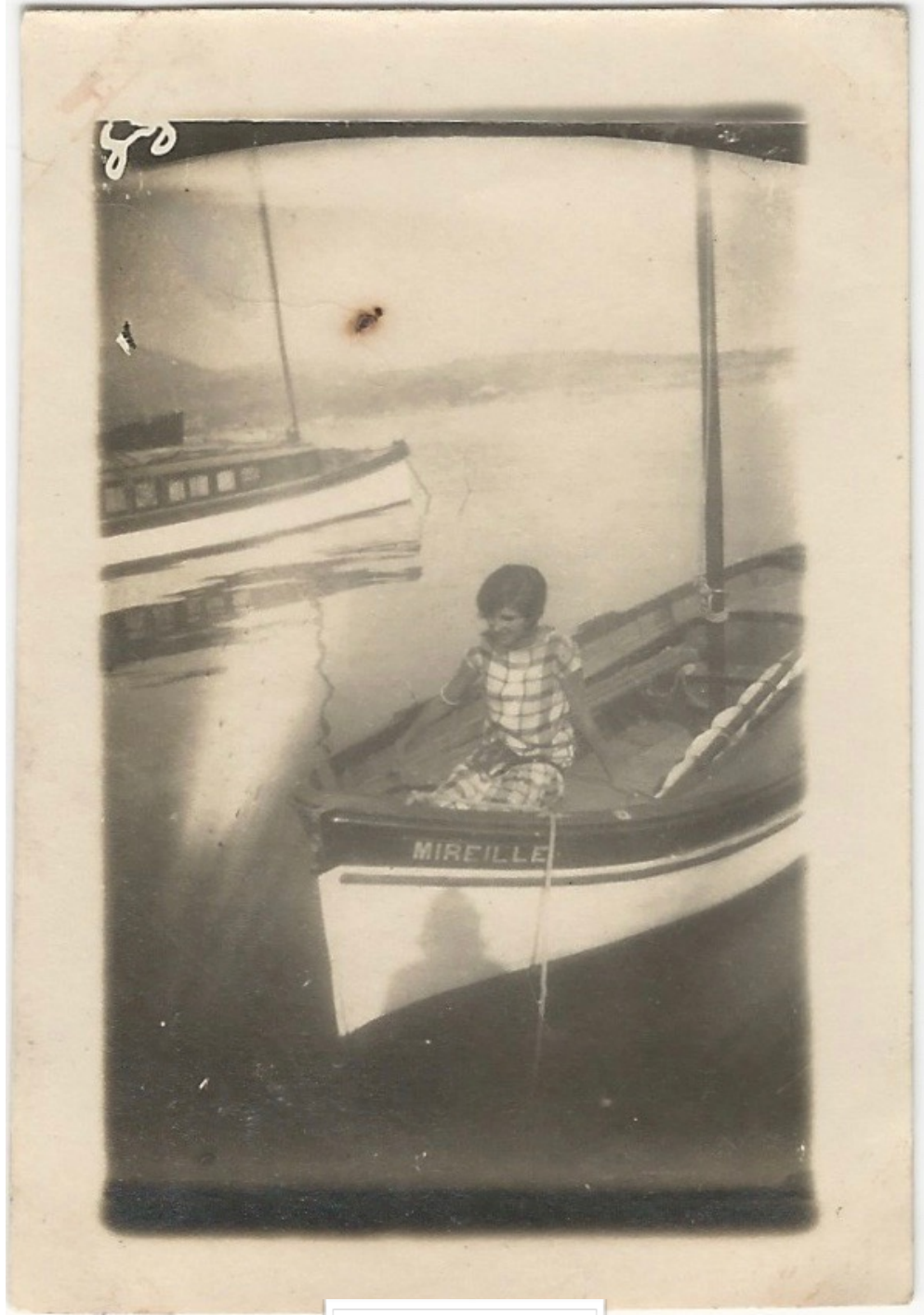
2"x2.75" - $10