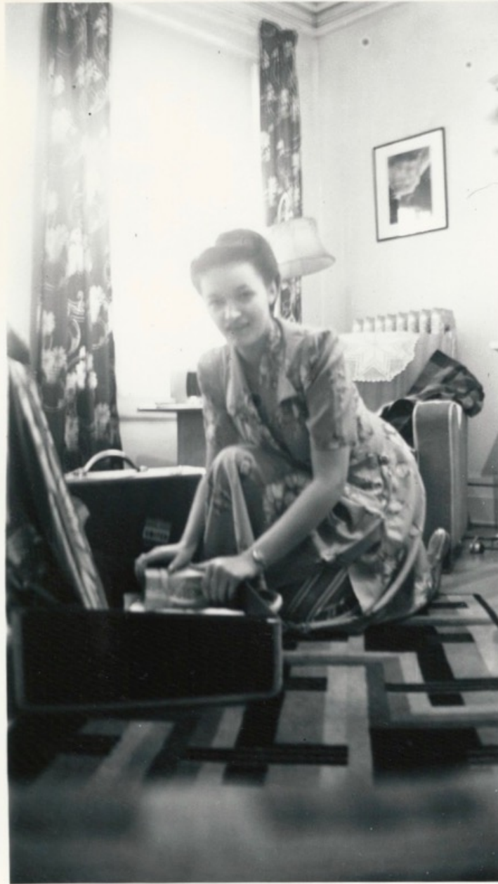
3.5"x5" - $10