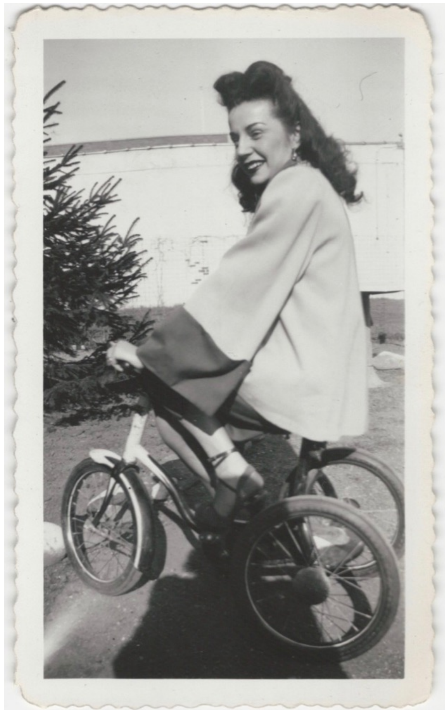
2.75"x4.5" - $10