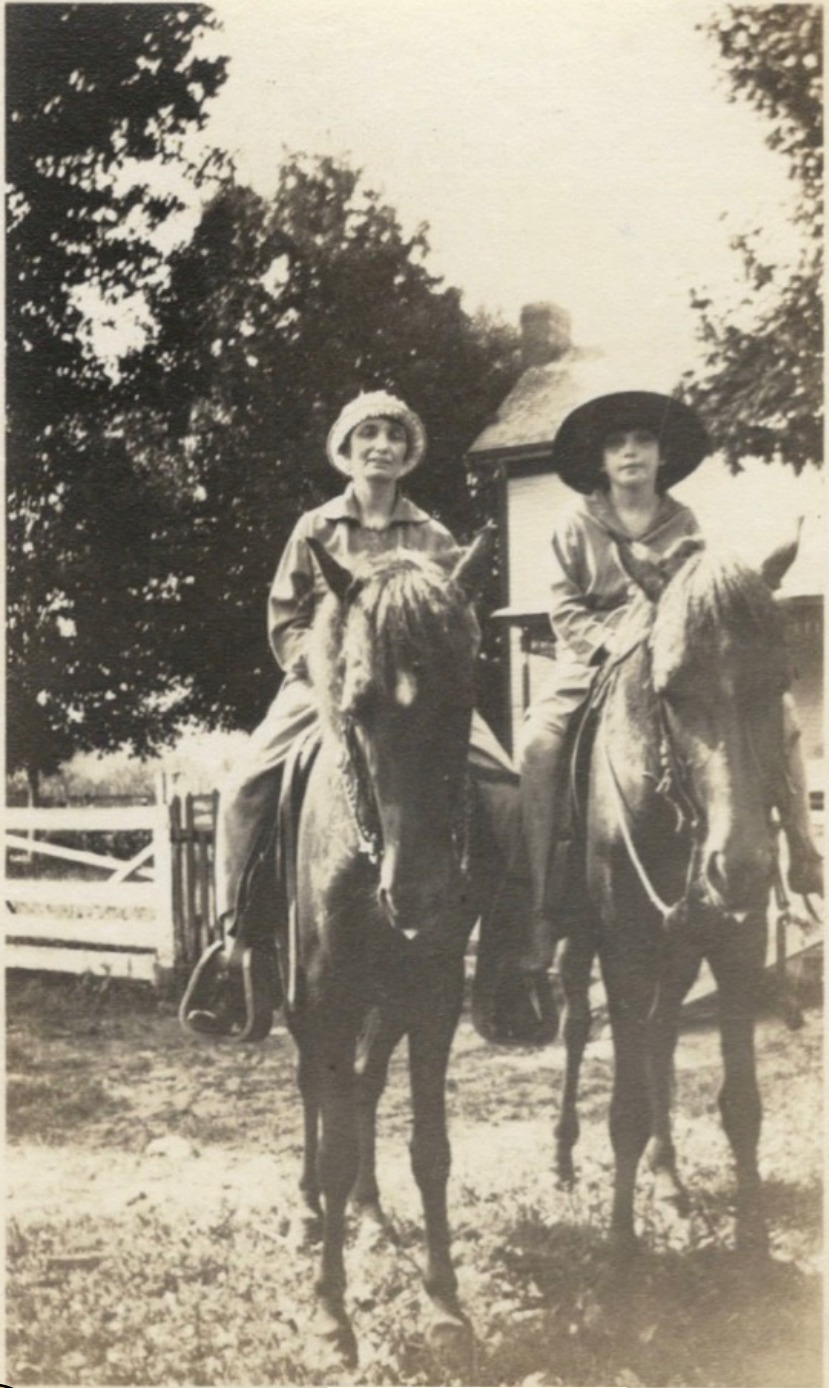
2.5"x4.25" - $10