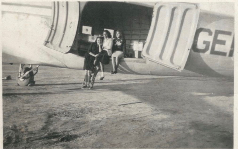
2.75"x2" - $10