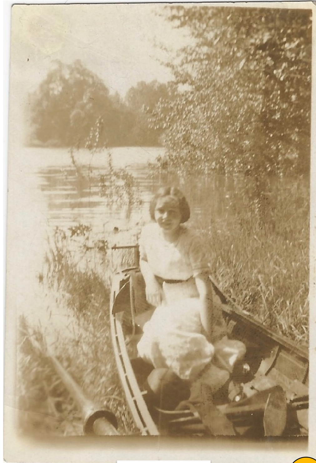
2.25"x3.25" - $10