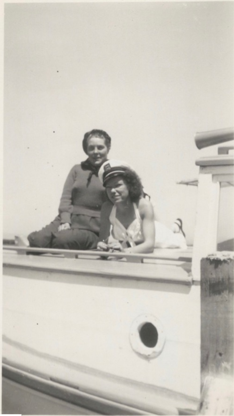
2.75"x4.5" - $10