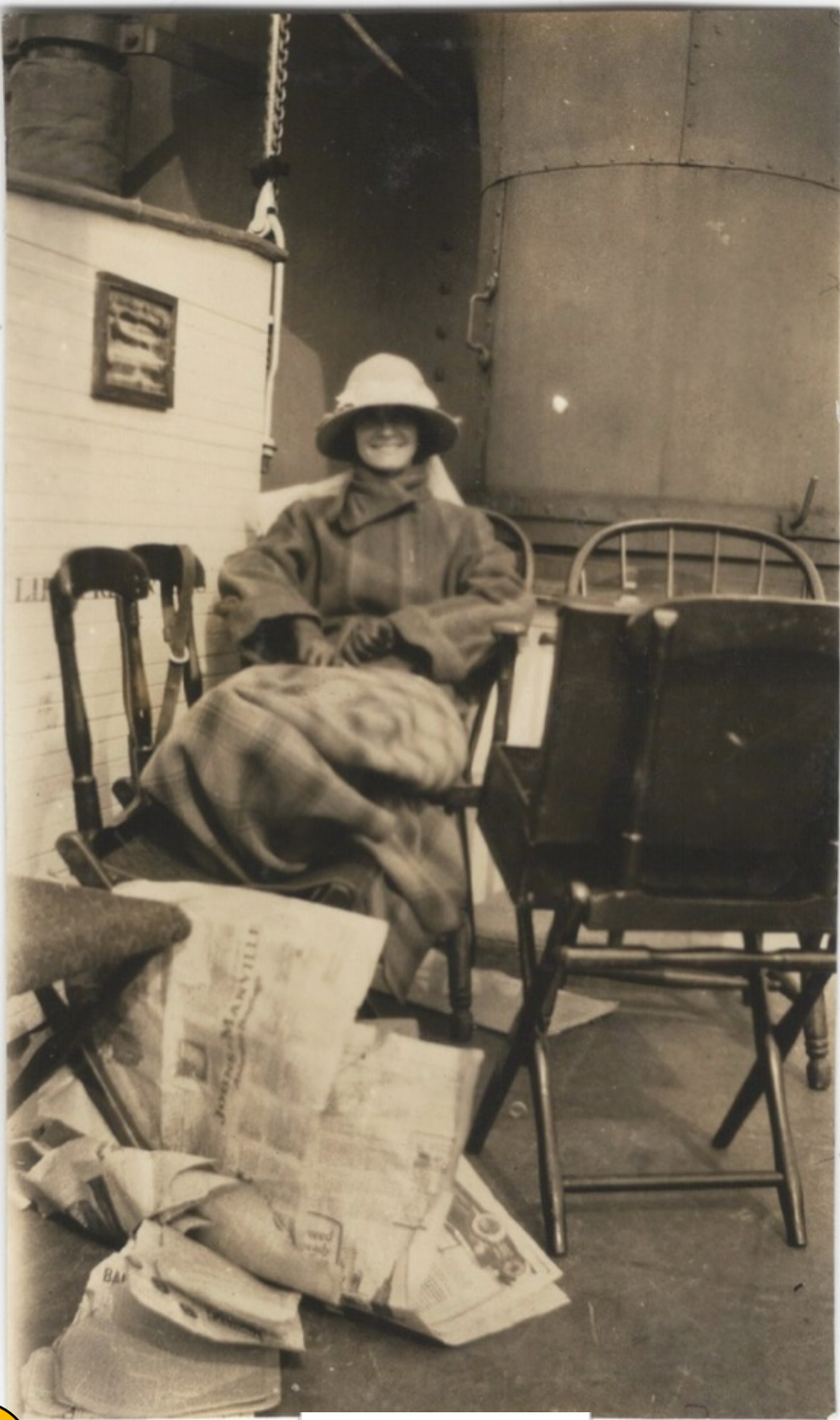
2.5"x4" - $10