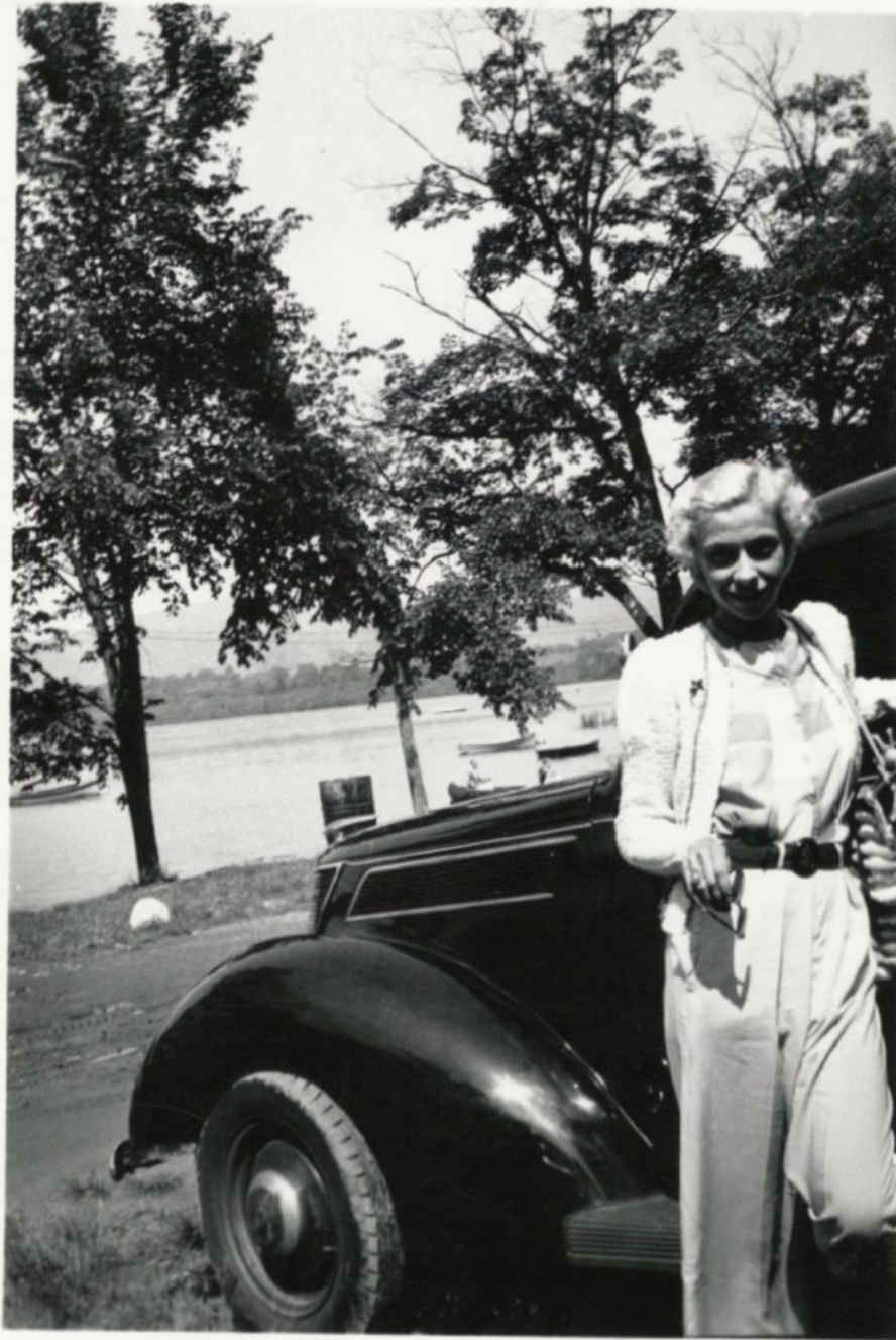
2.5"x3.5" - $10