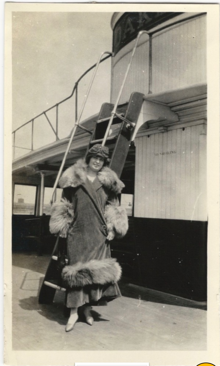
2.5"x4.5" - $10