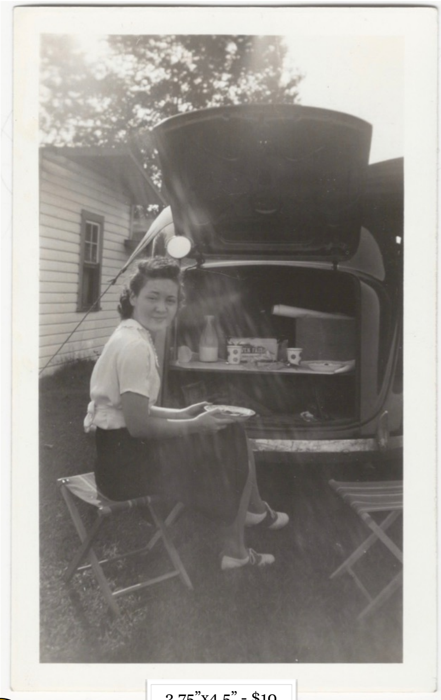
2.75"x4.5" - $10