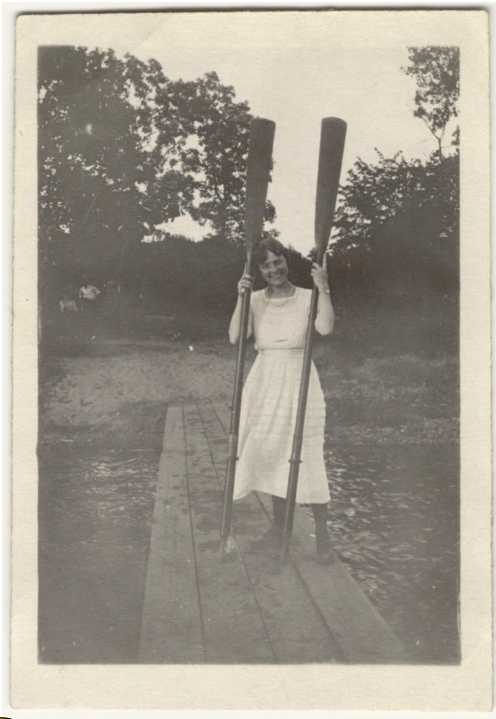
2.5"x3.5" - $10