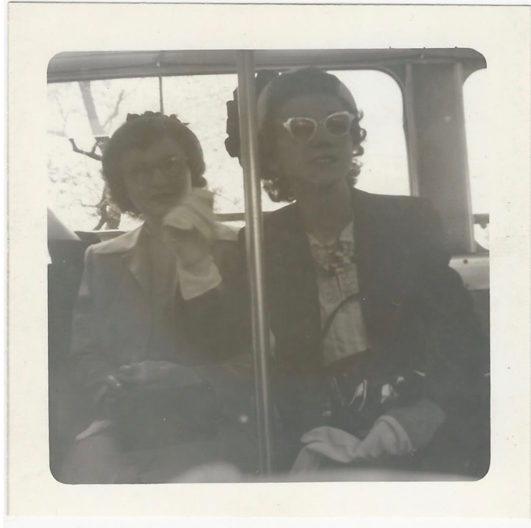
3.5"x3.5" - $10