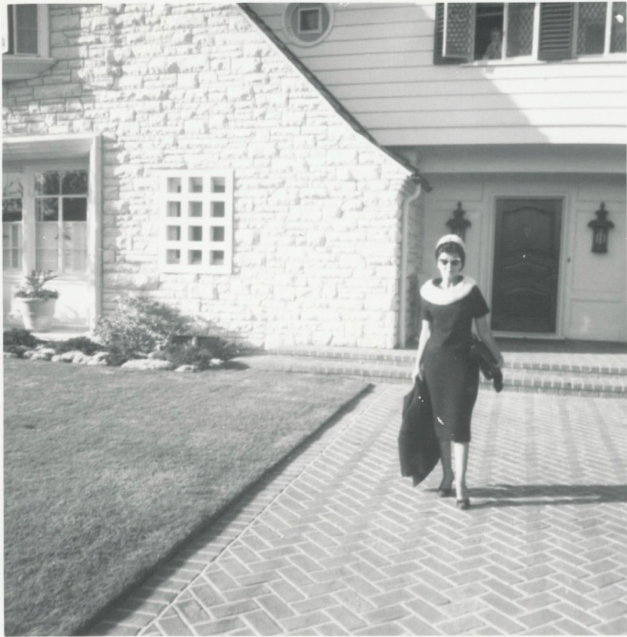
3.5"x3.5" - $10