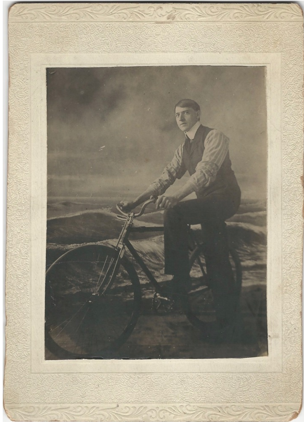
16. Cabinet photo. 4.25"x6" [mount] 3"x4.25" [image] - $25