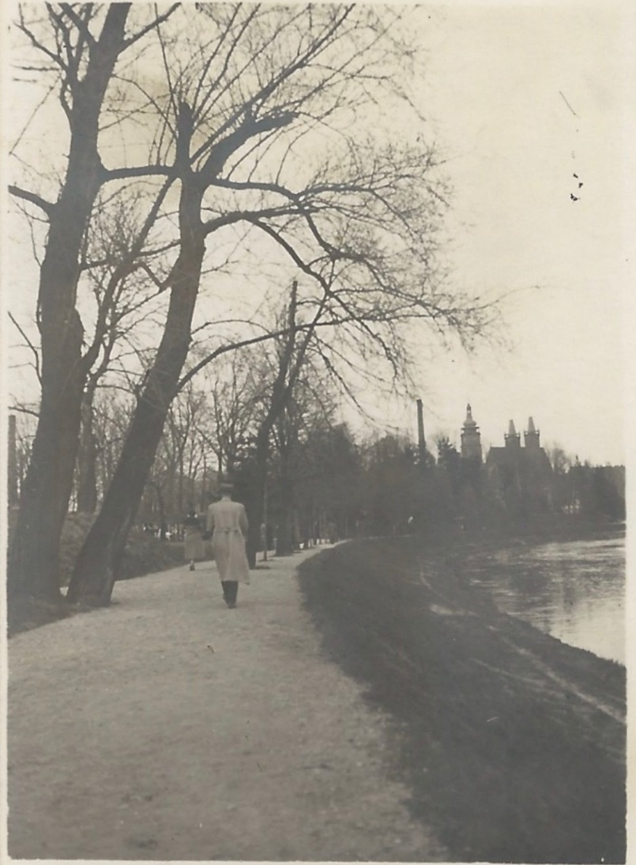
10. Snapshot. 2.5"x3.5" - $10