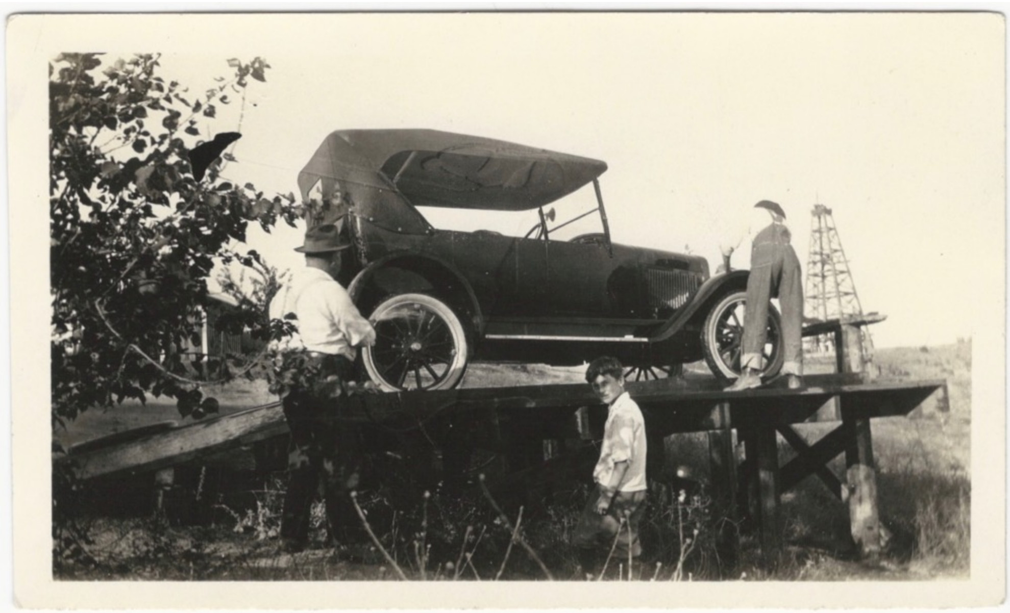
25. Snapshot. 4.5"x2.75" - $10