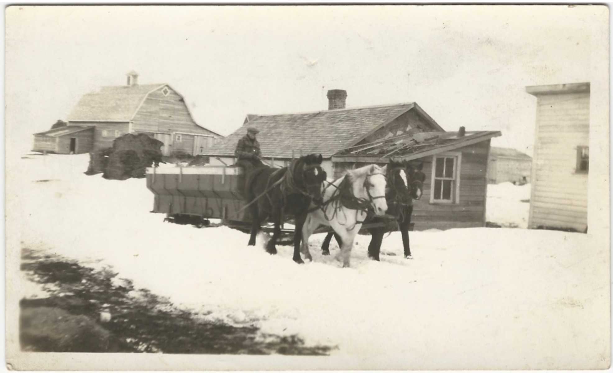
21. Snapshot. 5.75"x3.5" - $10