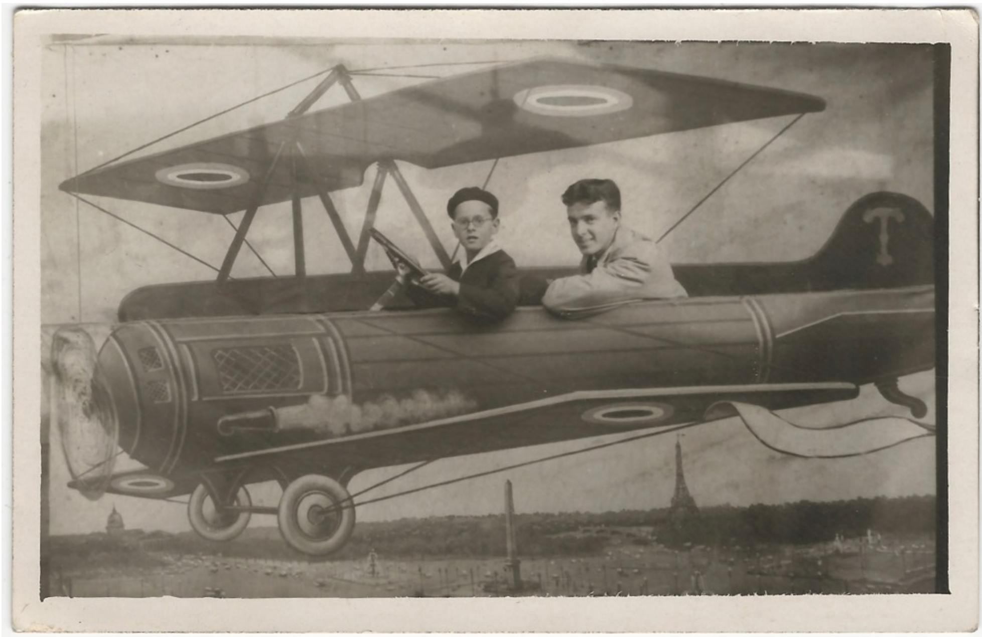
2. Real Photo Postcard. - $20