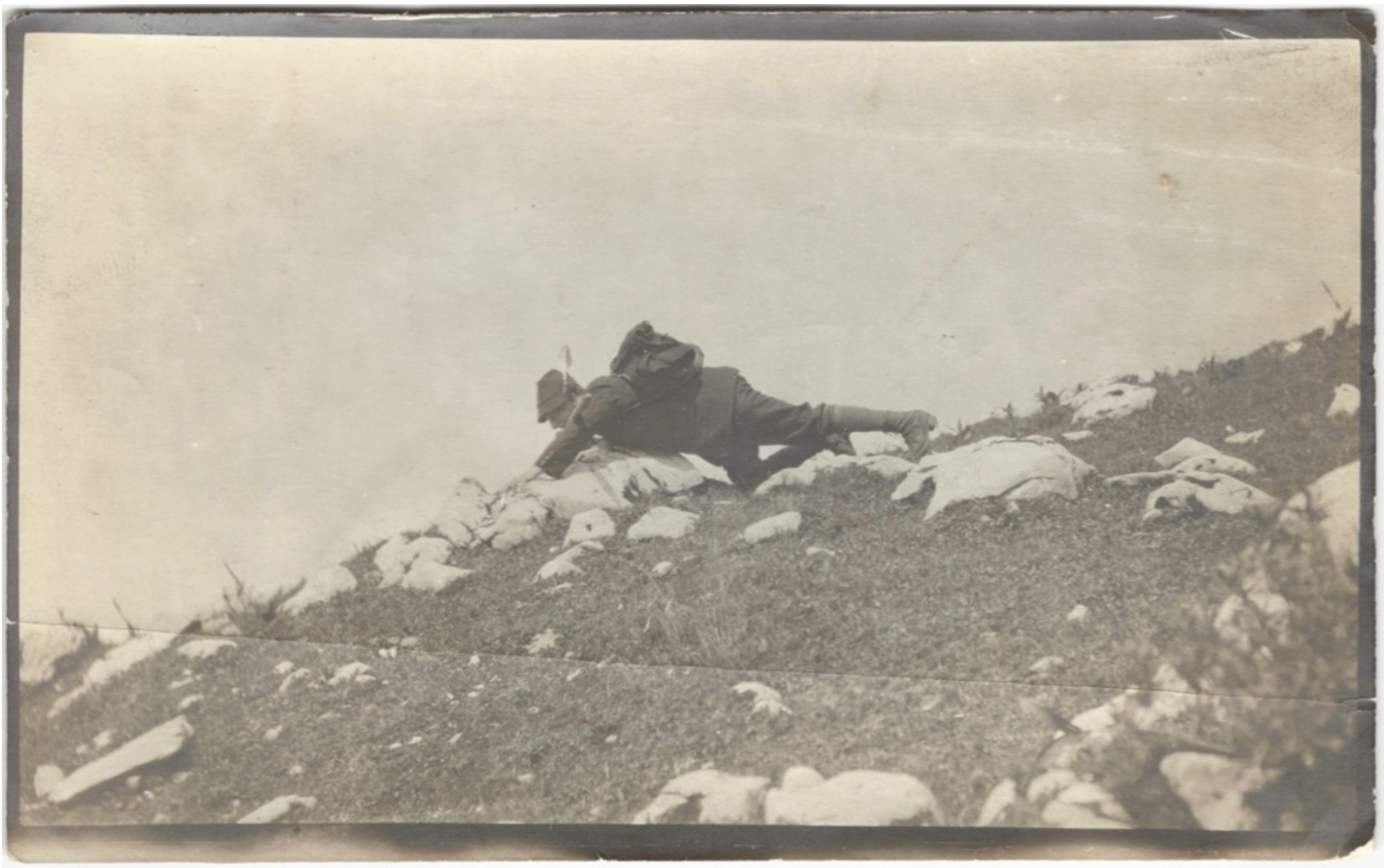
12. Snapshot. 5.5"x3.5" - $15