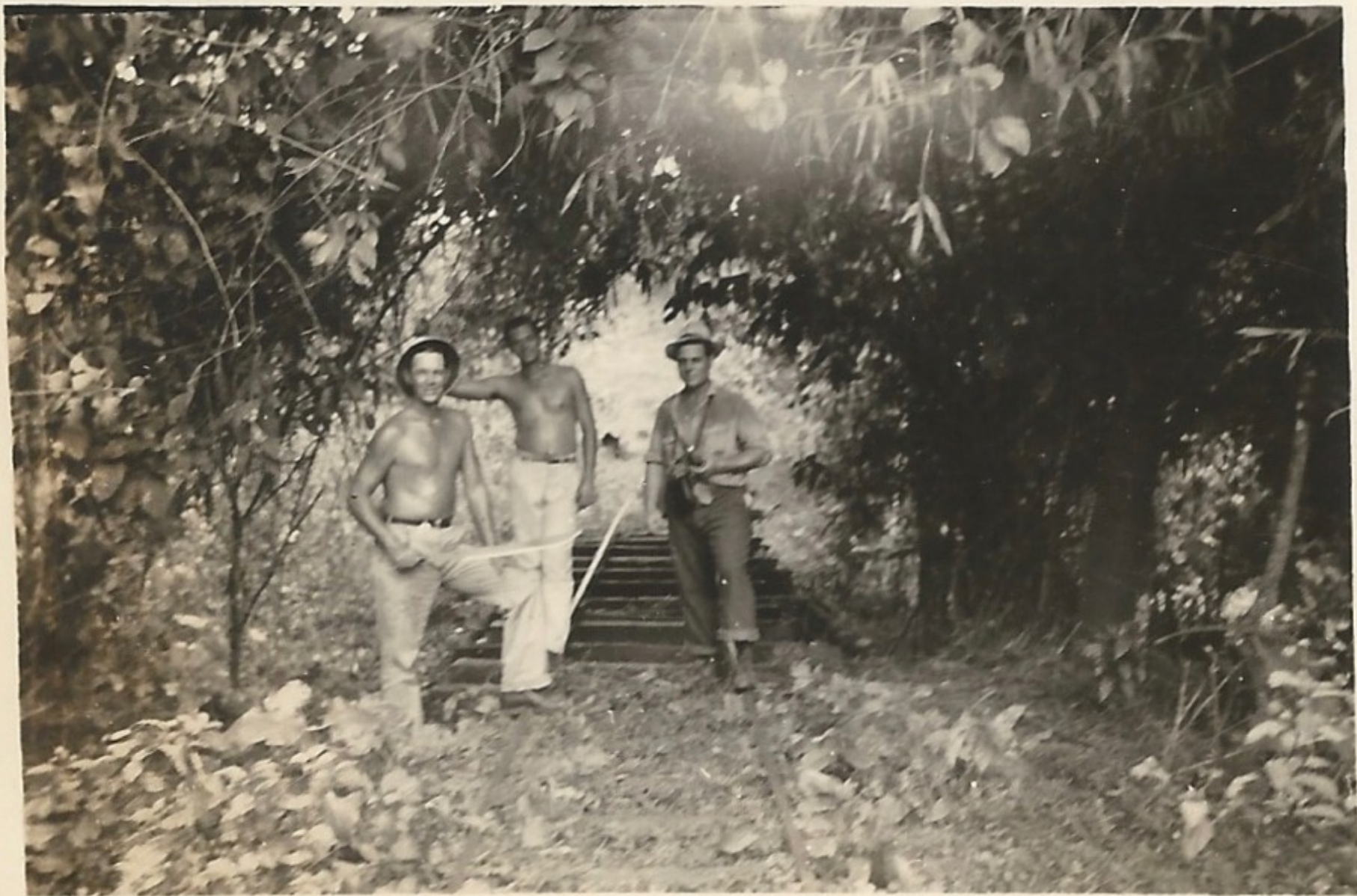
7. Snapshot. 3.5"x2.5" - $10