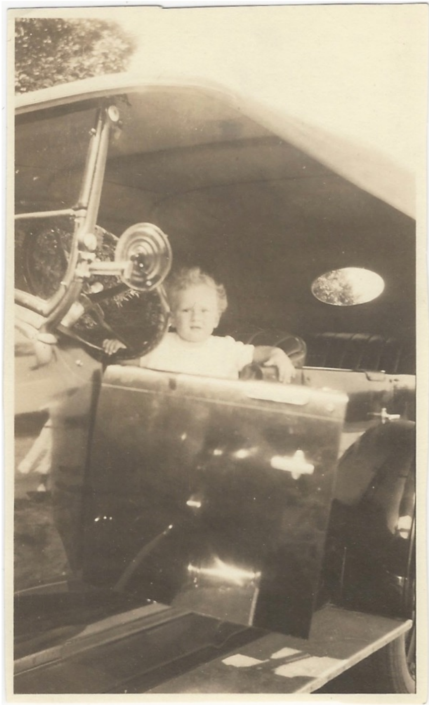
3. Snapshot. 2.5"x4.25" - $10