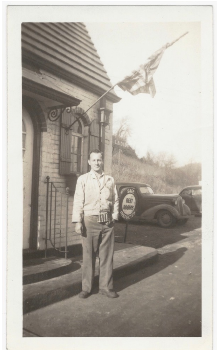
32. Snapshot. 2.75"x4.5" - $10