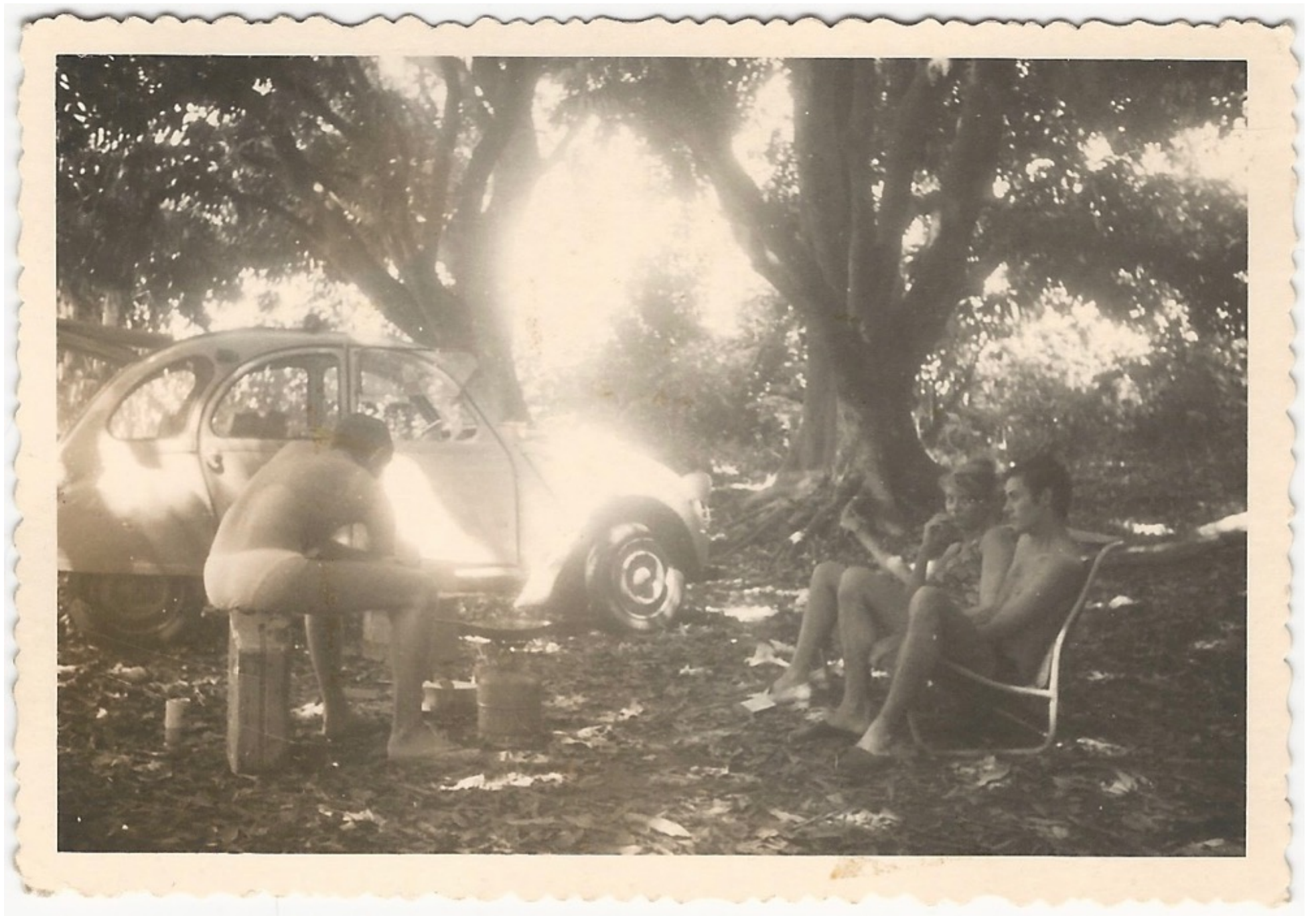
8. Snapshot. 4"x3" - $15