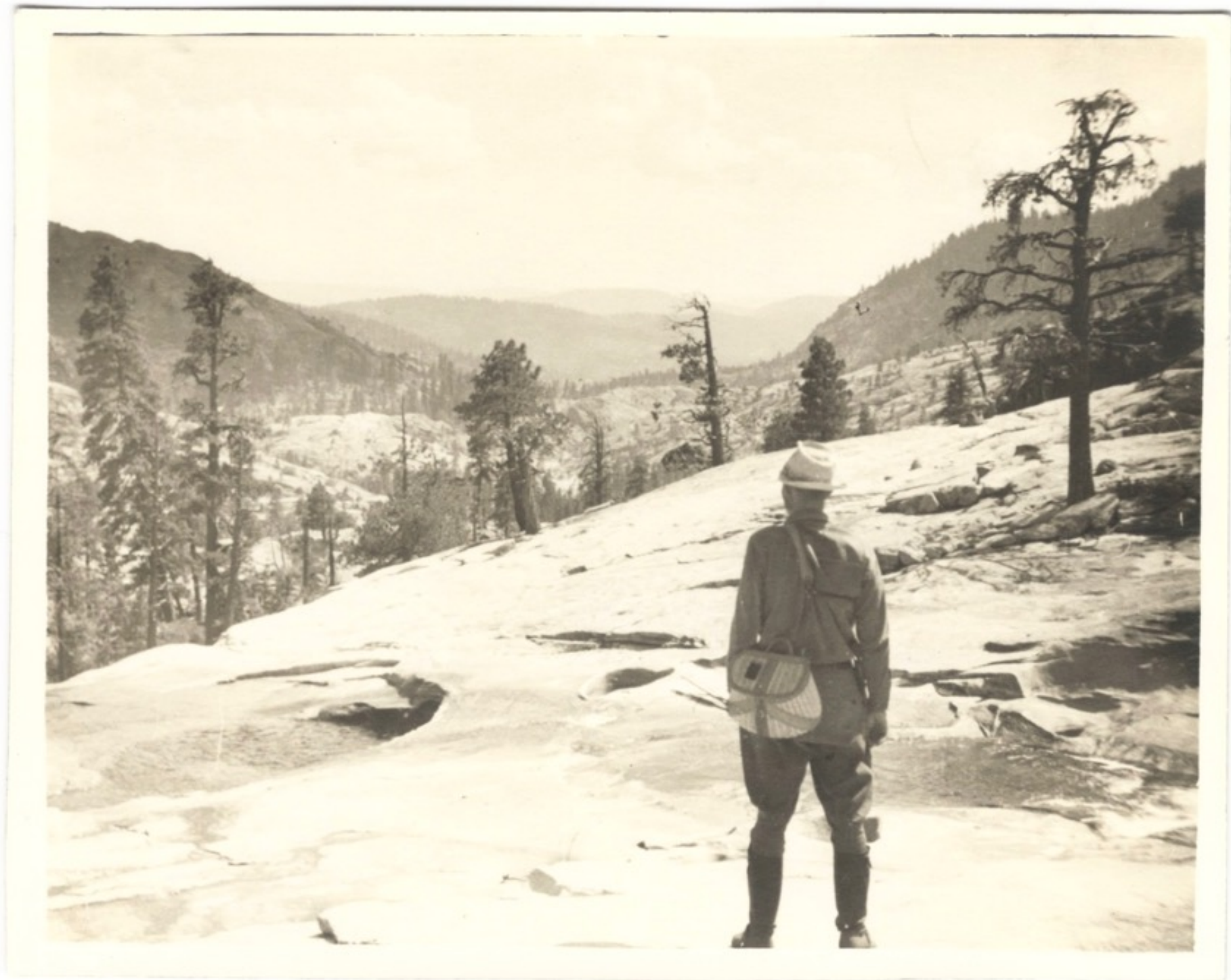
13. Snapshot. 5"x4" - $15