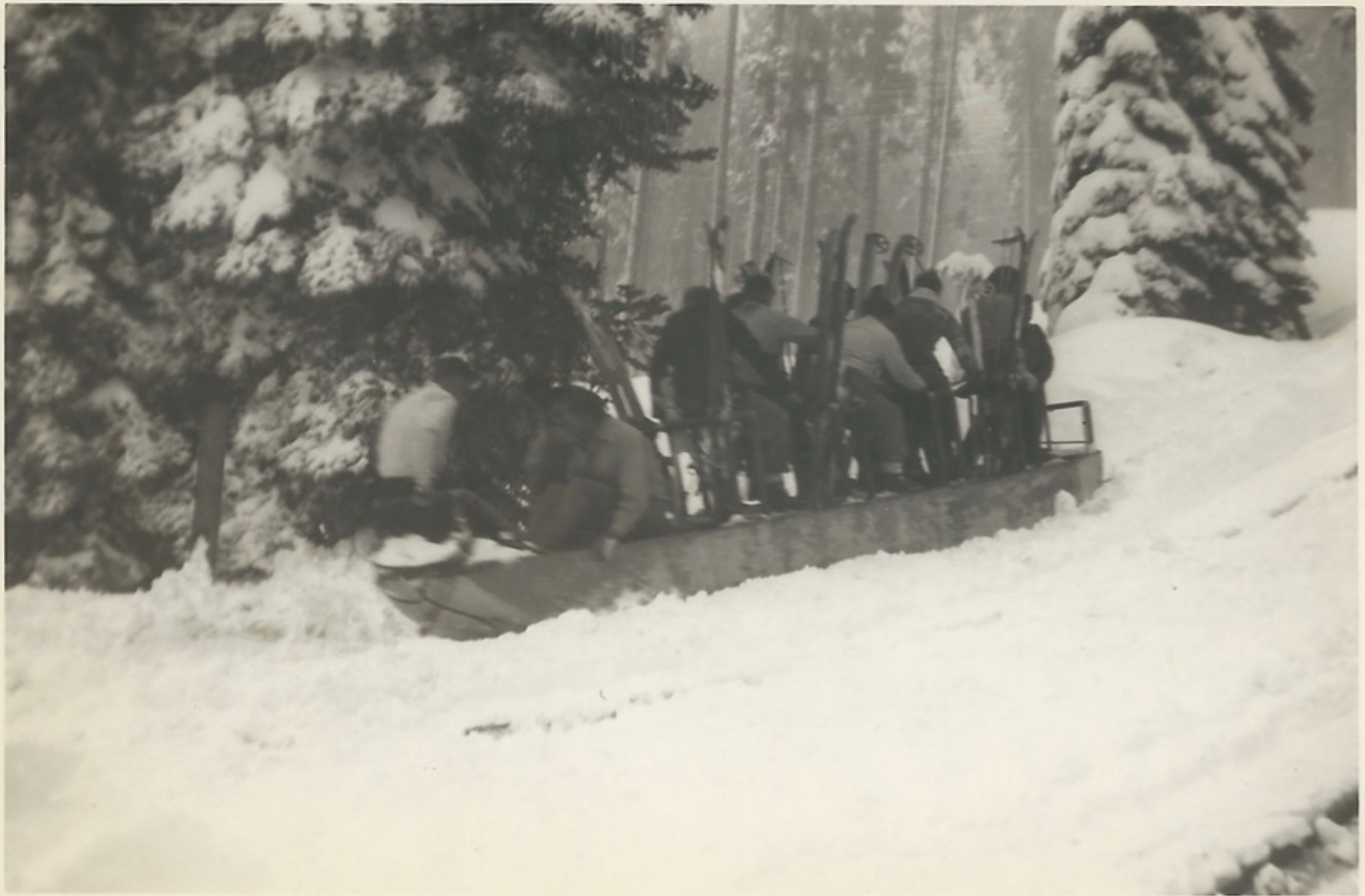
22. Snapshot. 5"x3.5" - $10