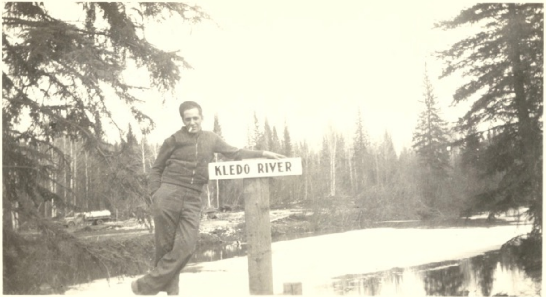
28. Snapshot. 4.5"x2.75" - $25