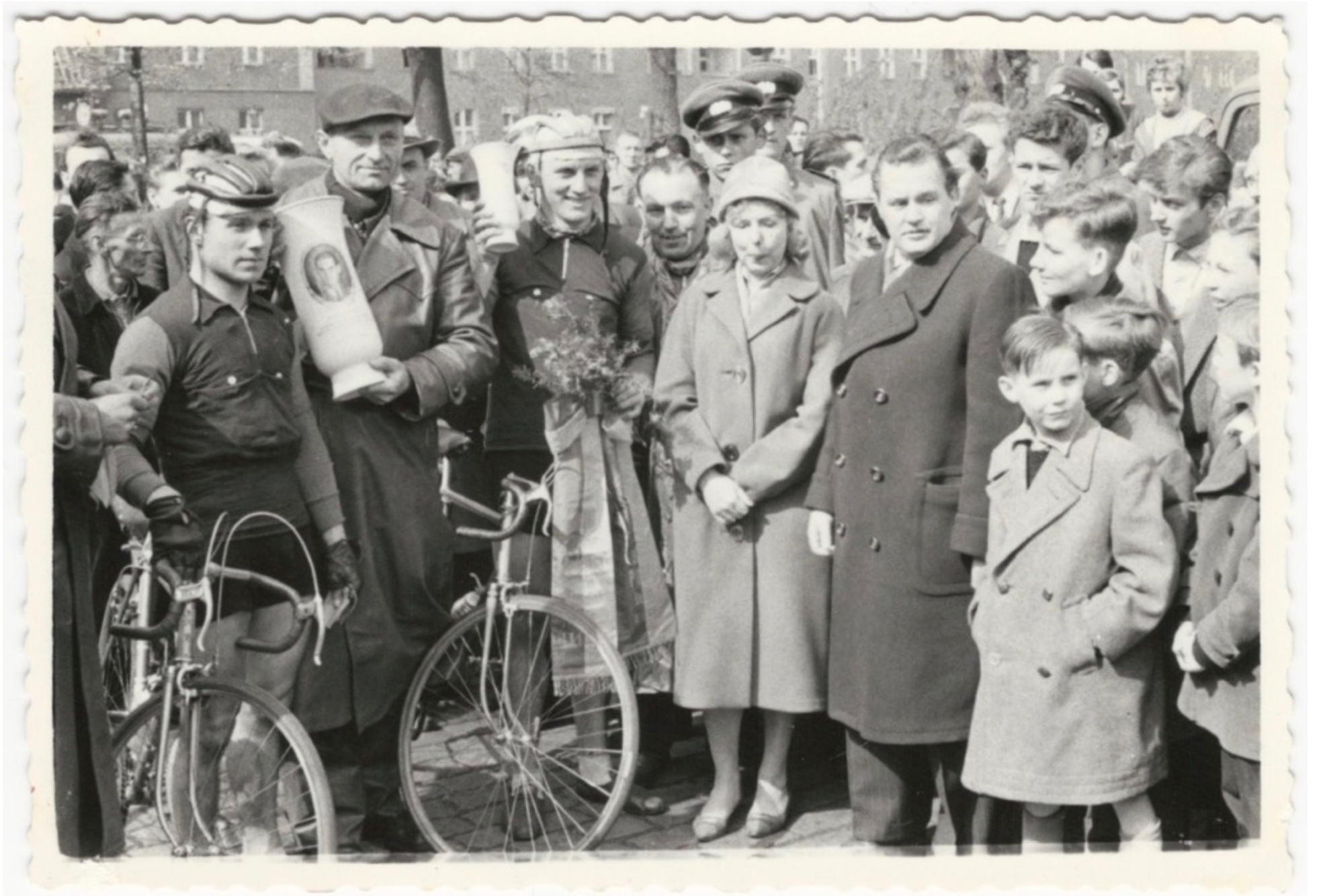
27. Snapshot. 4"x2.75" - $10