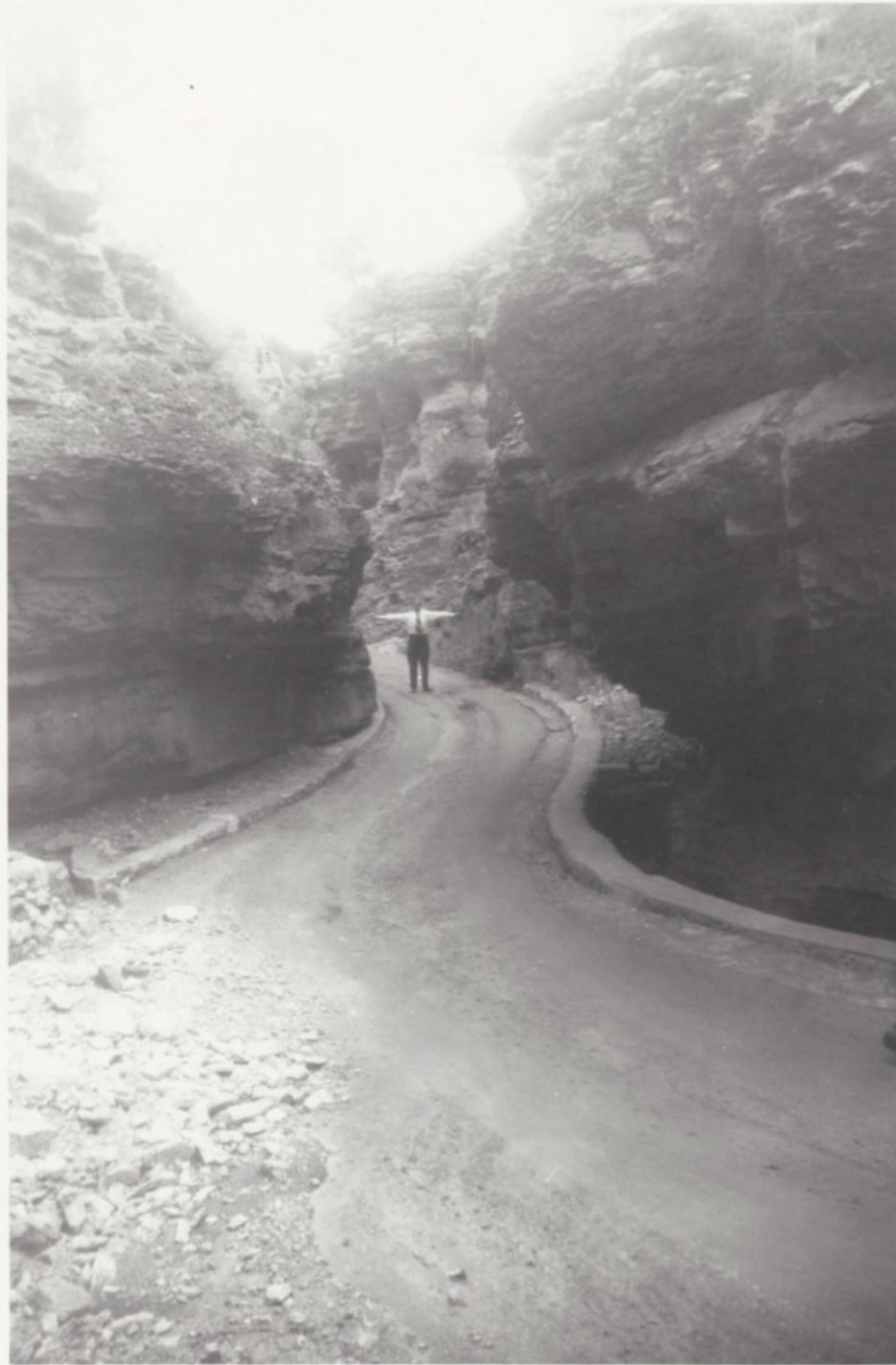
34. Snapshot. 3.5"x5" - $10