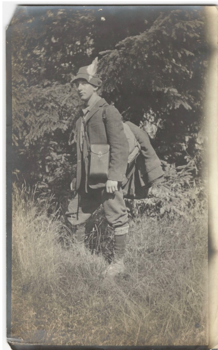
30. Snapshot. 3.25"x5.5" - $15