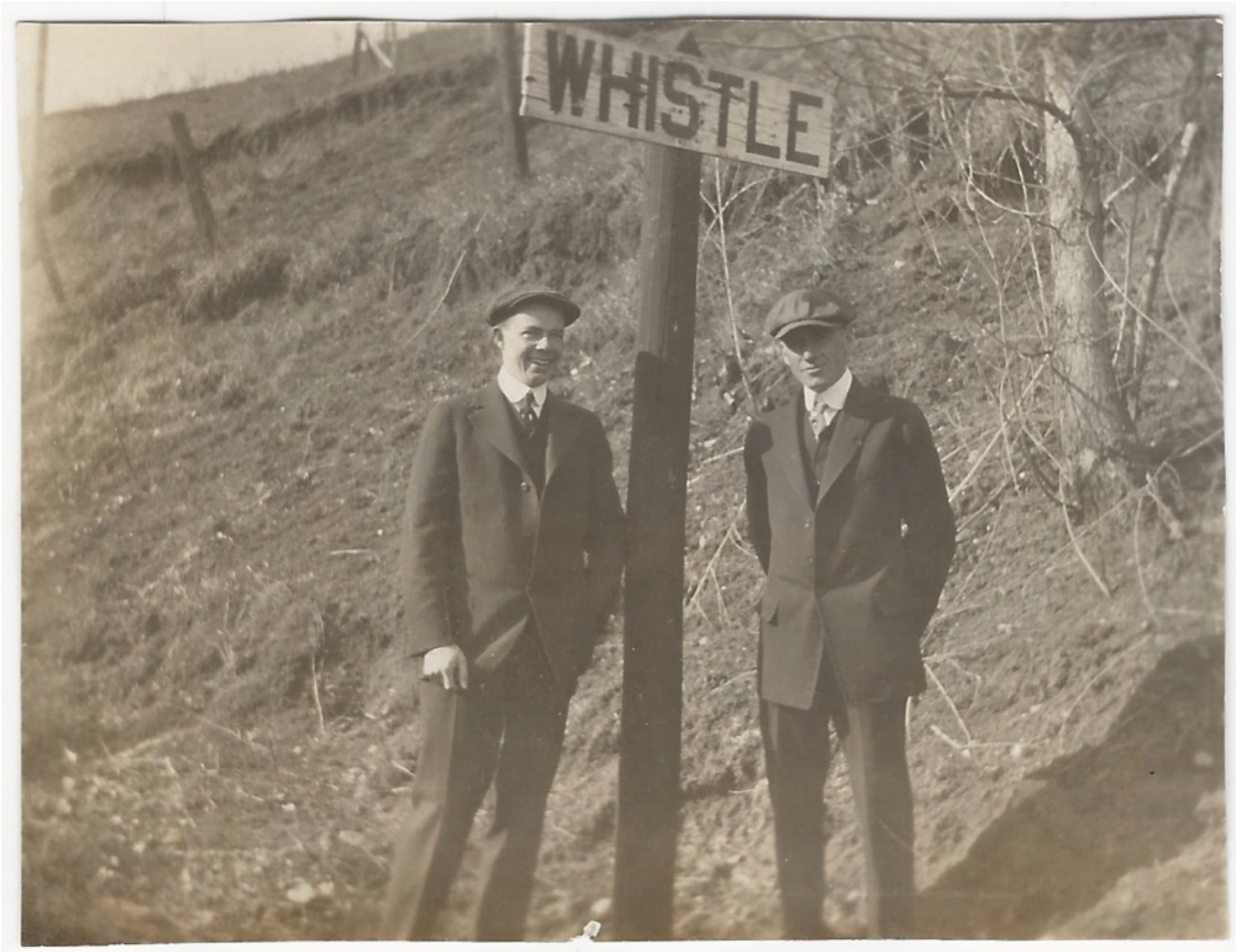
14. Snapshot. 3.75"x3" - $10