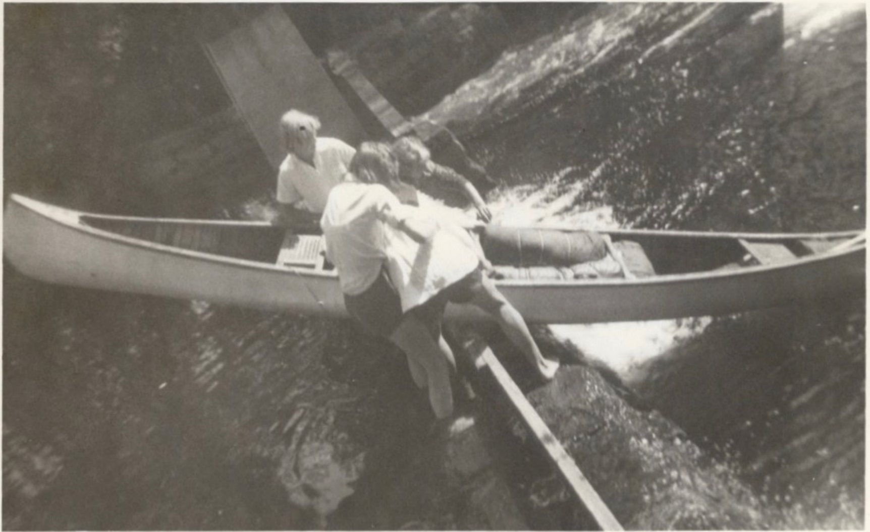
17. Snapshot. 4.5"x3" - $10