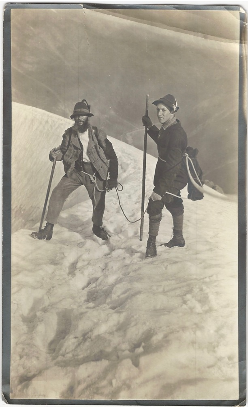
23. Snapshot. 5.5"x3.25" - $15