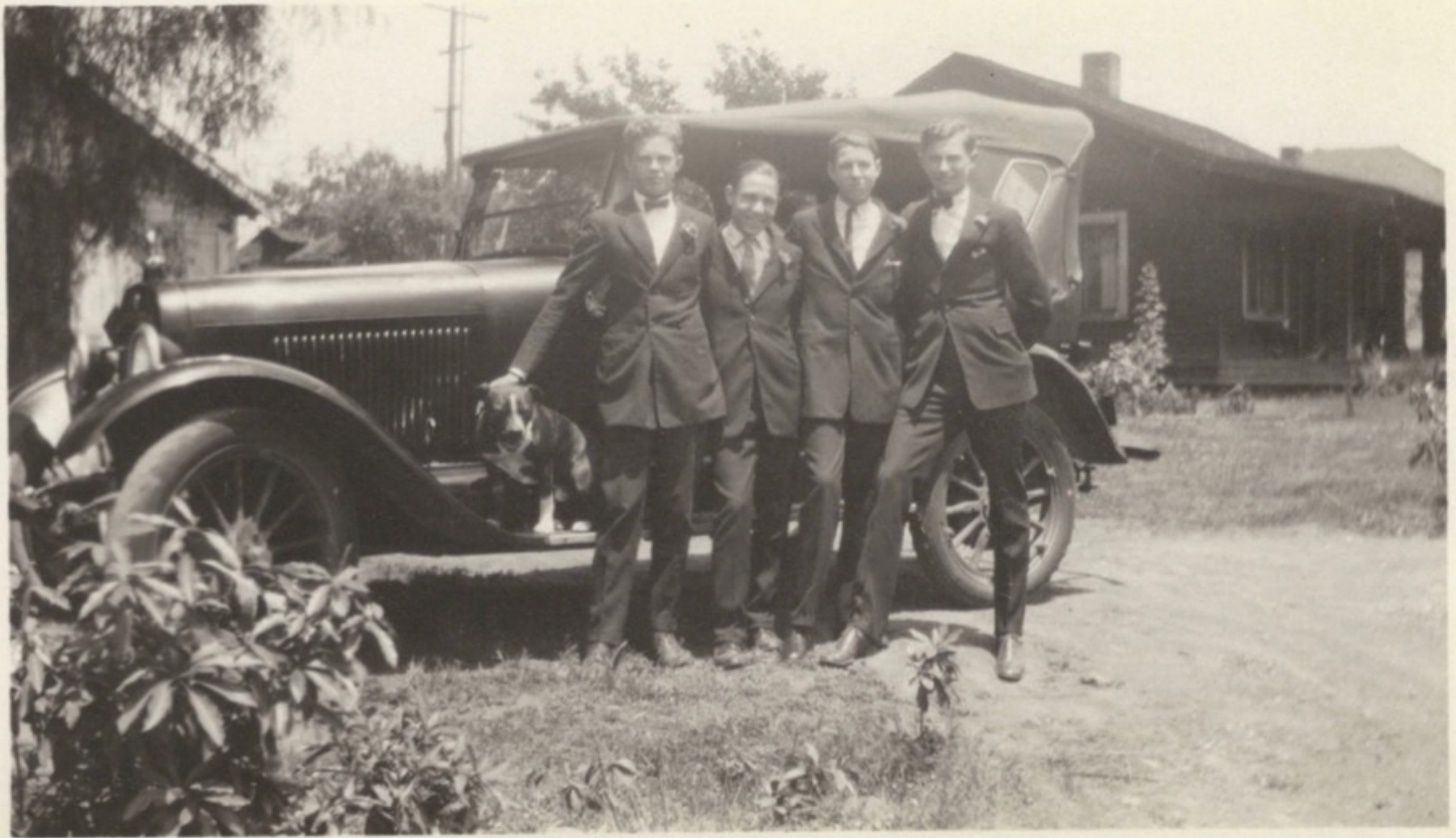
26. Snapshot. 4.5"x2.75" - $10