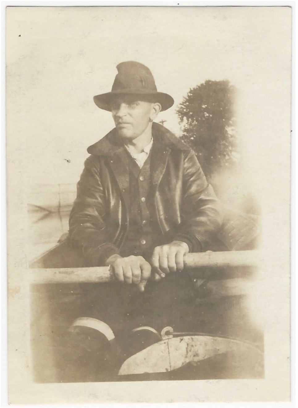
24. Snapshot. 2.5"x3.5" - $10