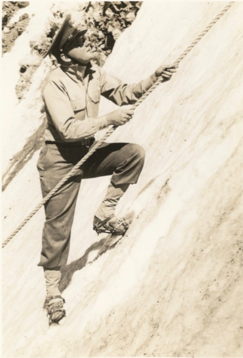
9. Snapshot. 3.25"x4.5" - $10