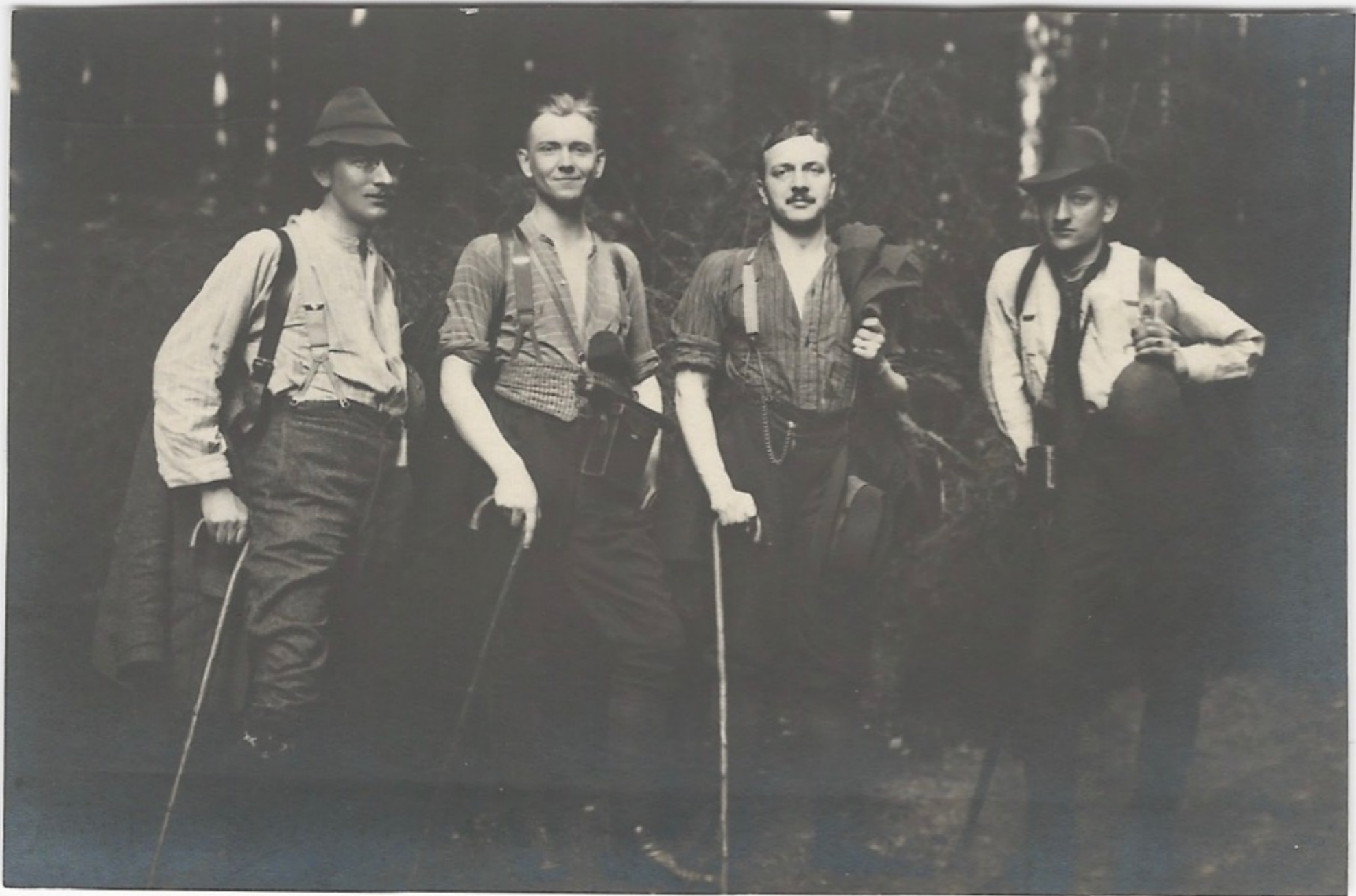
5. Snapshot. 4"x2.75" - $10