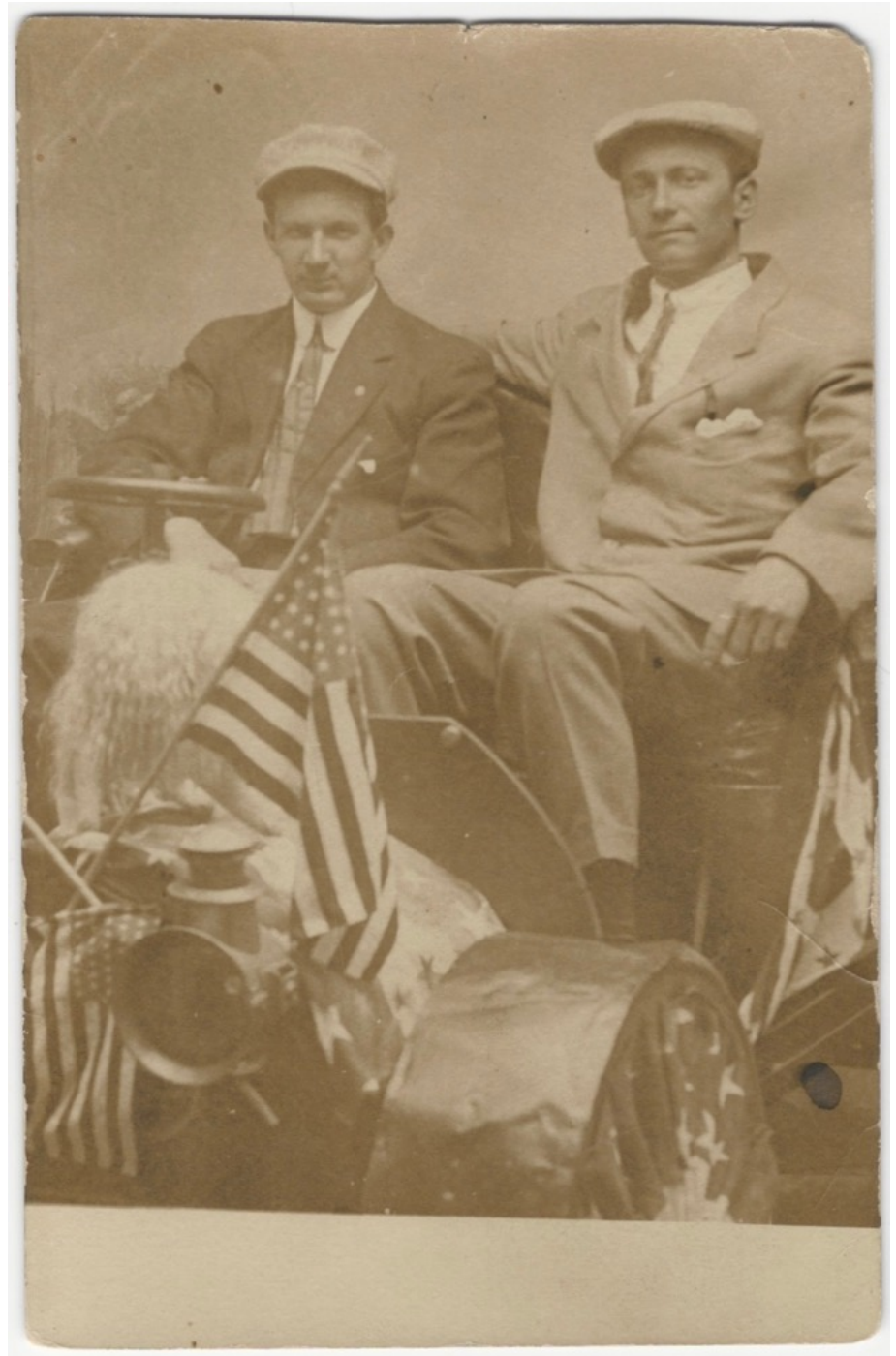
4. Real Photo Postcard. - $25