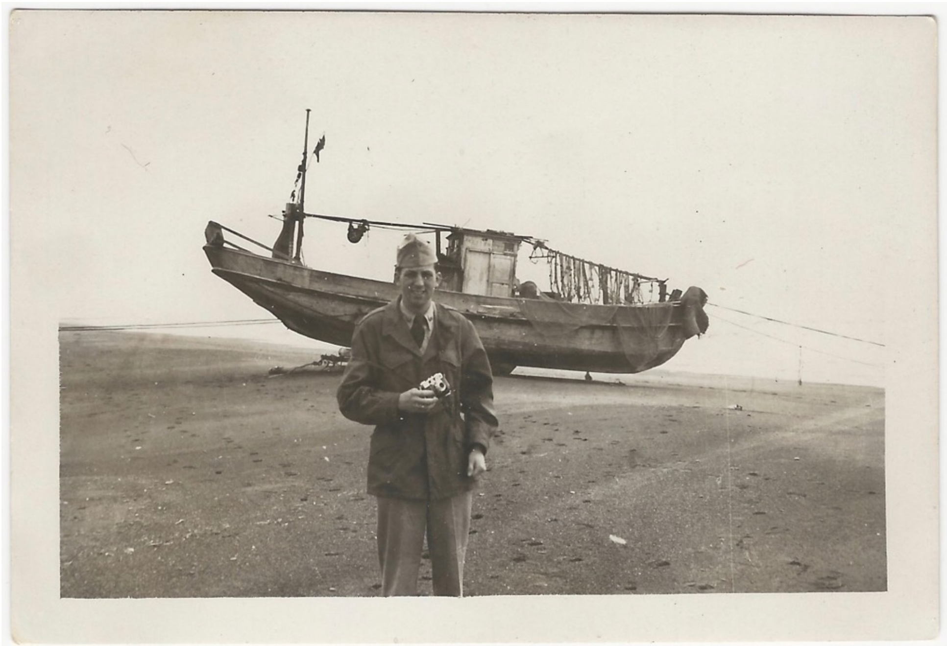
11. Snapshot. 4.75"x3.25" - $15