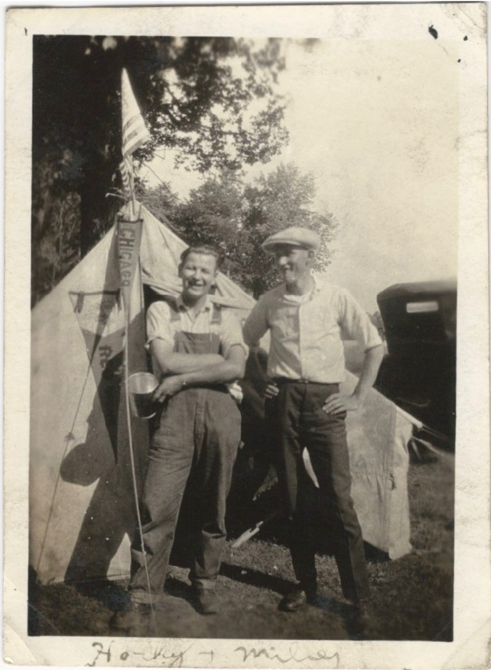
19. Snapshot. 2.25"x3.25" - $10