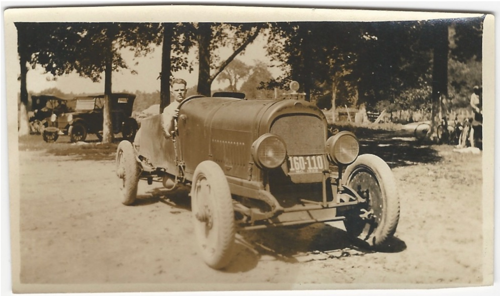
1. Snapshot. 2"x3" - $15