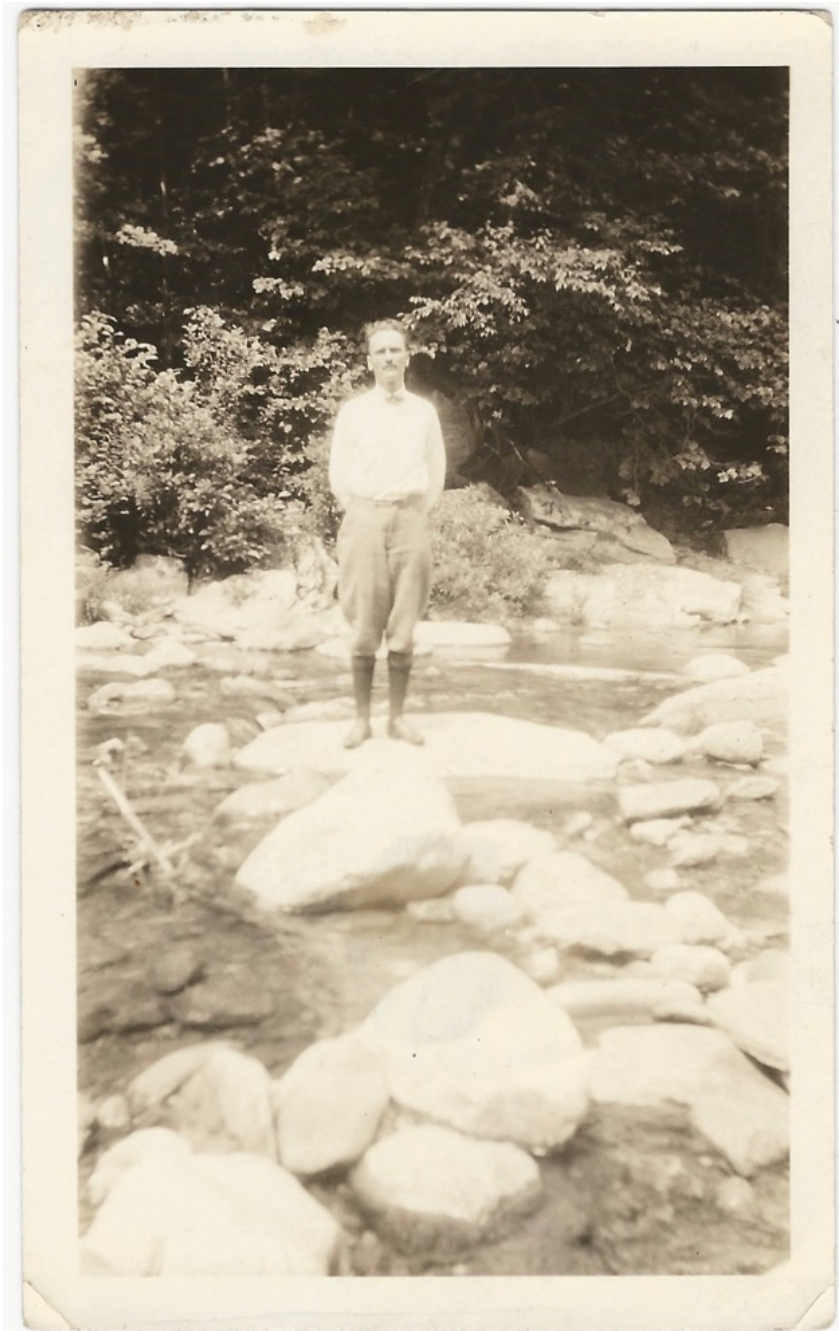
29. Snapshot. 3.25"x5" - $10