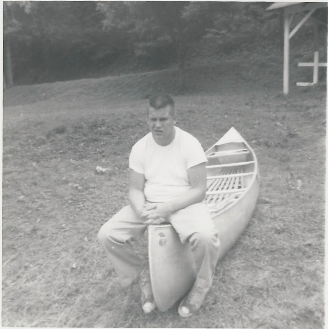
18. Snapshot. 3.5"x3.5" - $10