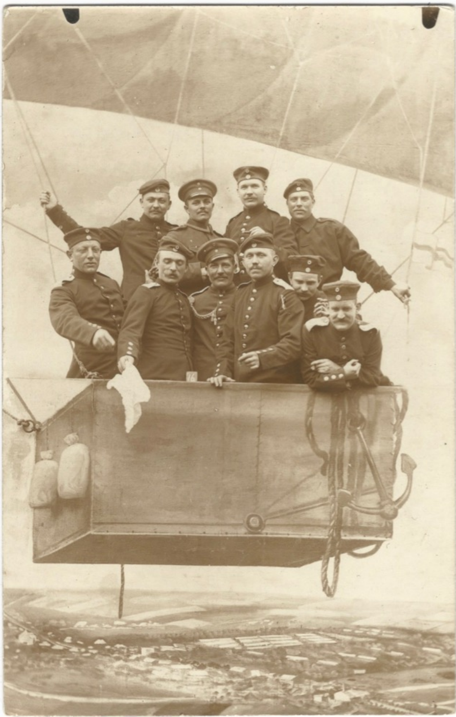
15. Real Photo Postcard. - $40