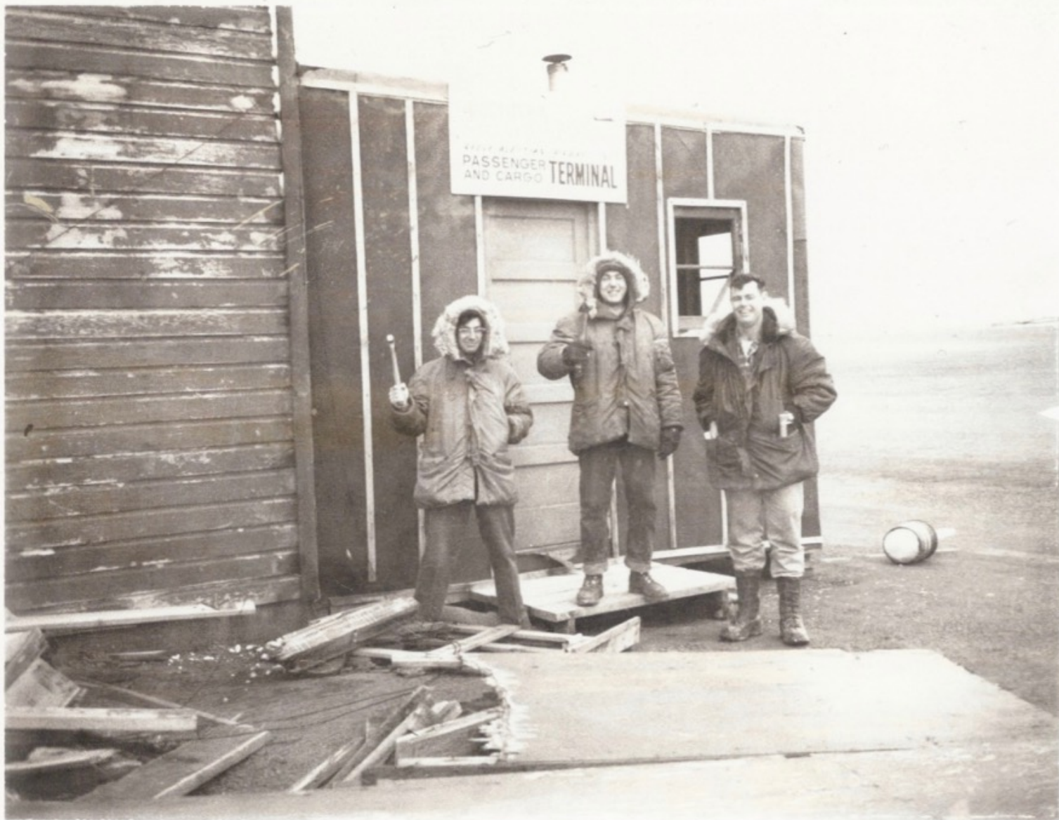
6. Snapshot. 4.25"x3.5" - $10