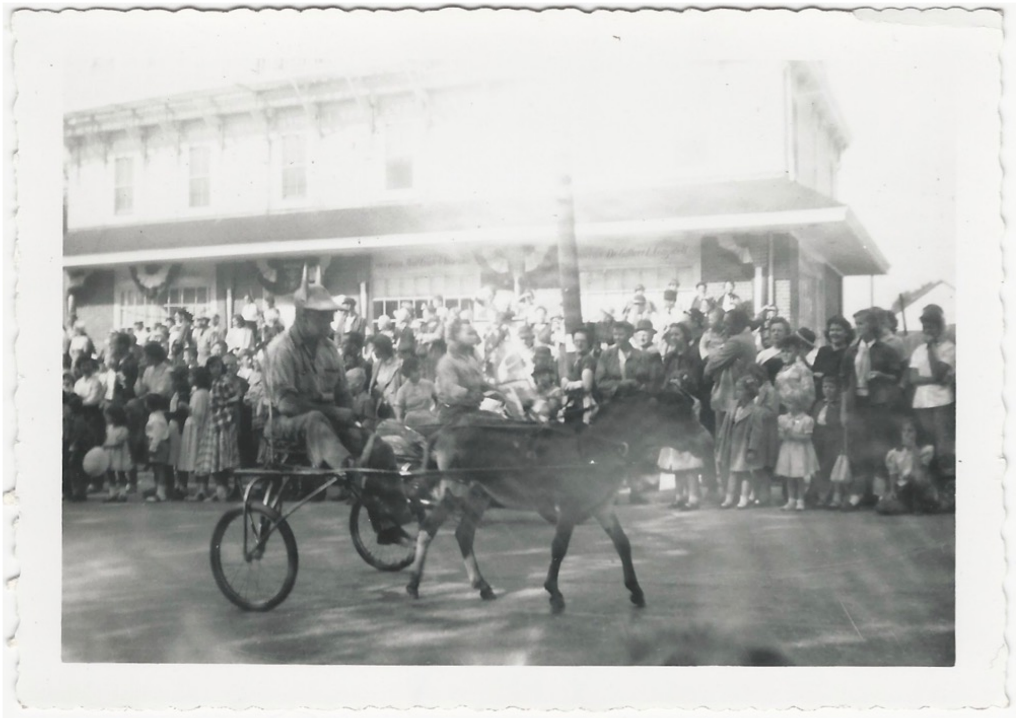
33. Snapshot. 5"x3.5" - $10