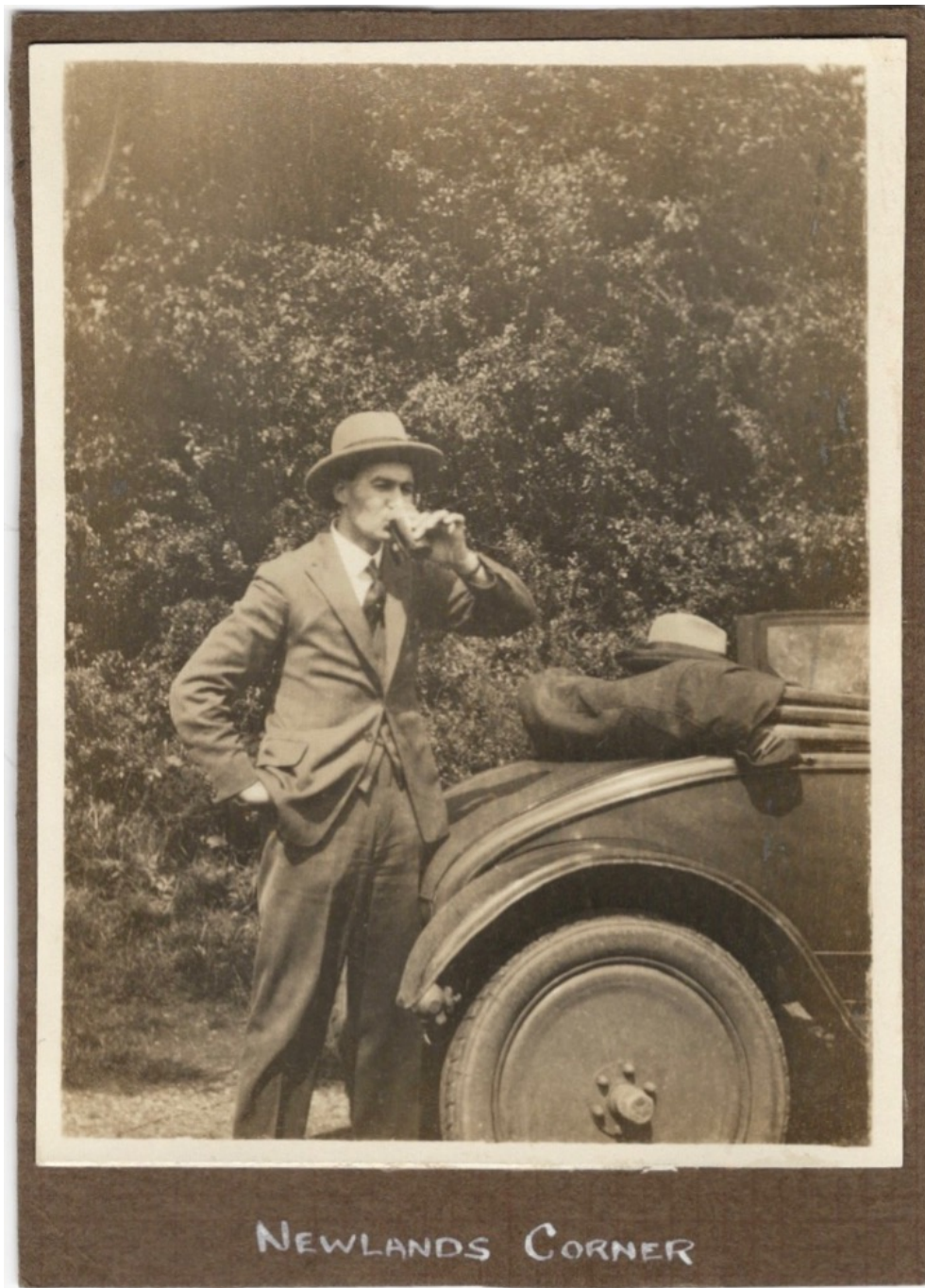
31. Snapshot. 3.25"x4" - $25