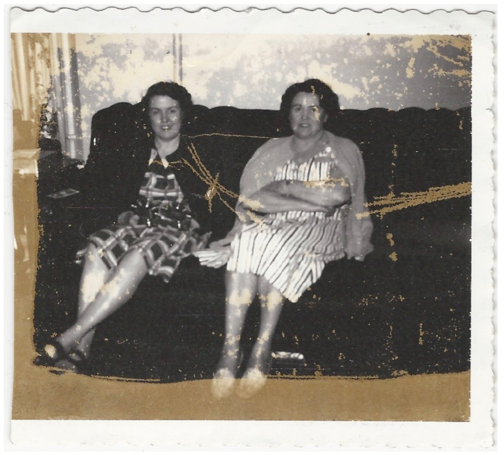
#18. 3.5"x3.25". $8