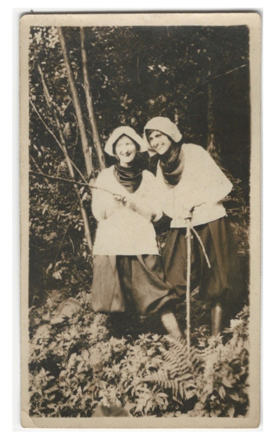
#16. 3.5"x4.5". $8