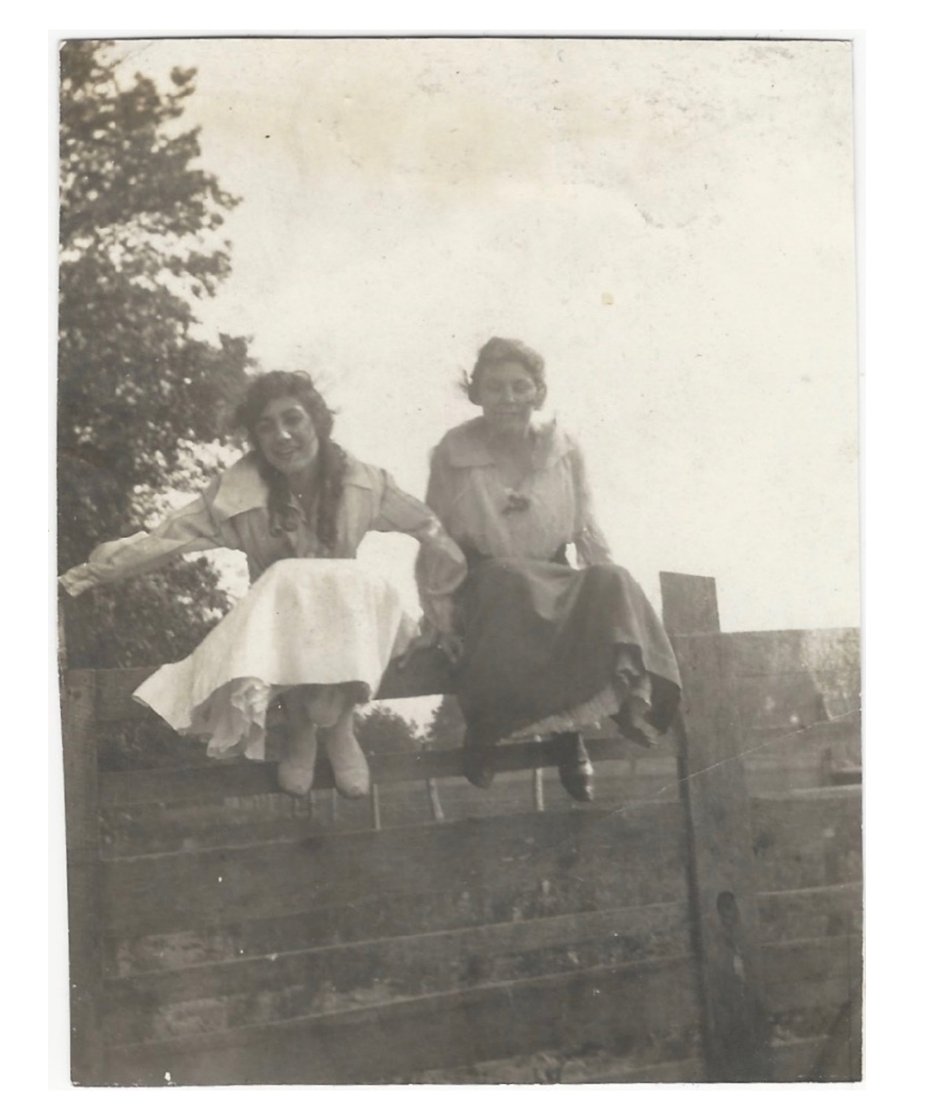
#25. 3"x4". $8