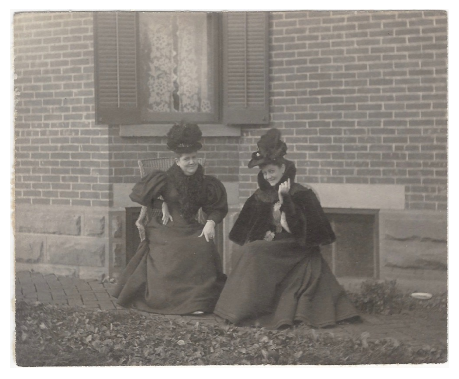
#24. 4.5"x3.5". $8