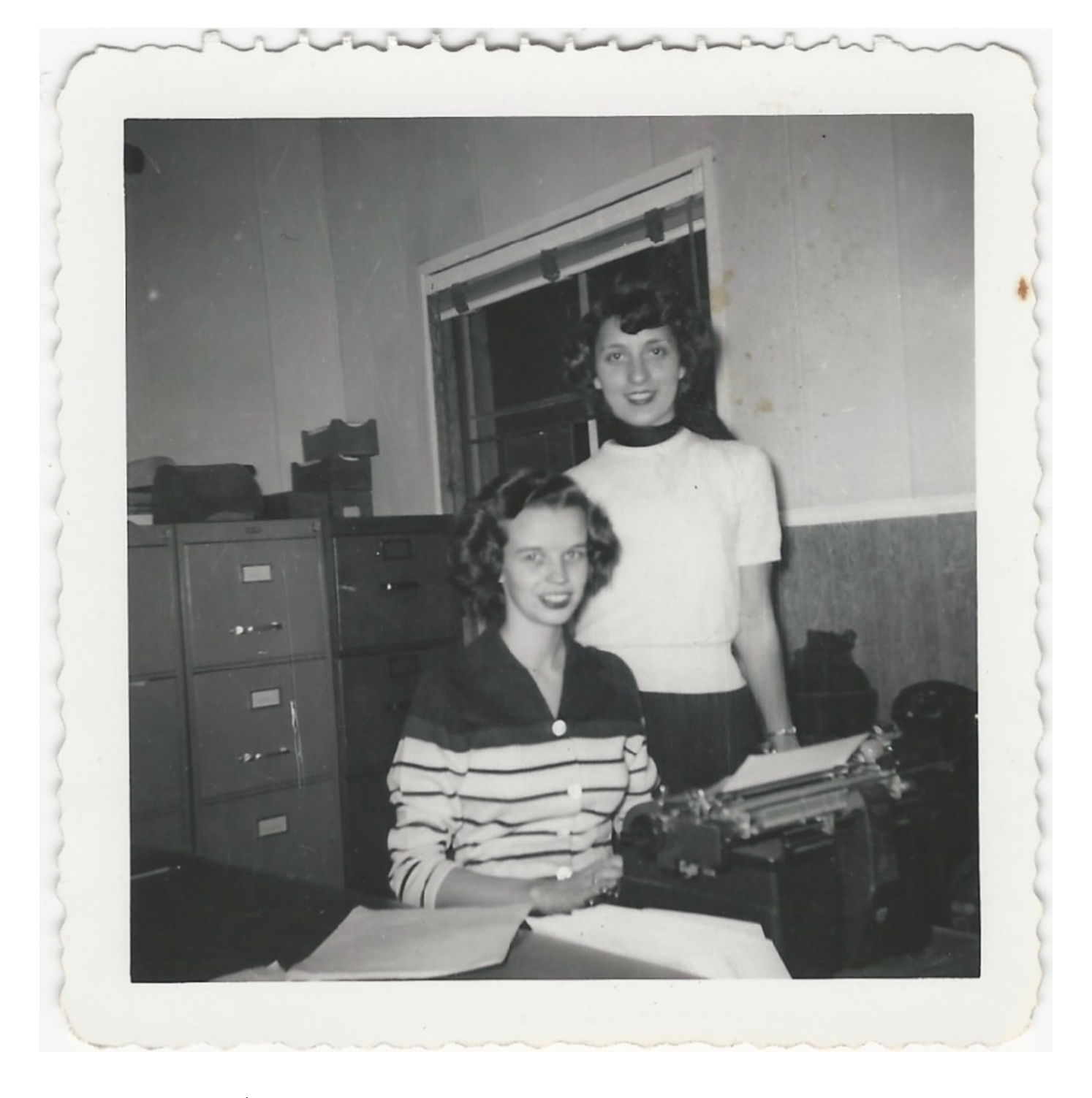
#22. 3.5"x3.5". $8