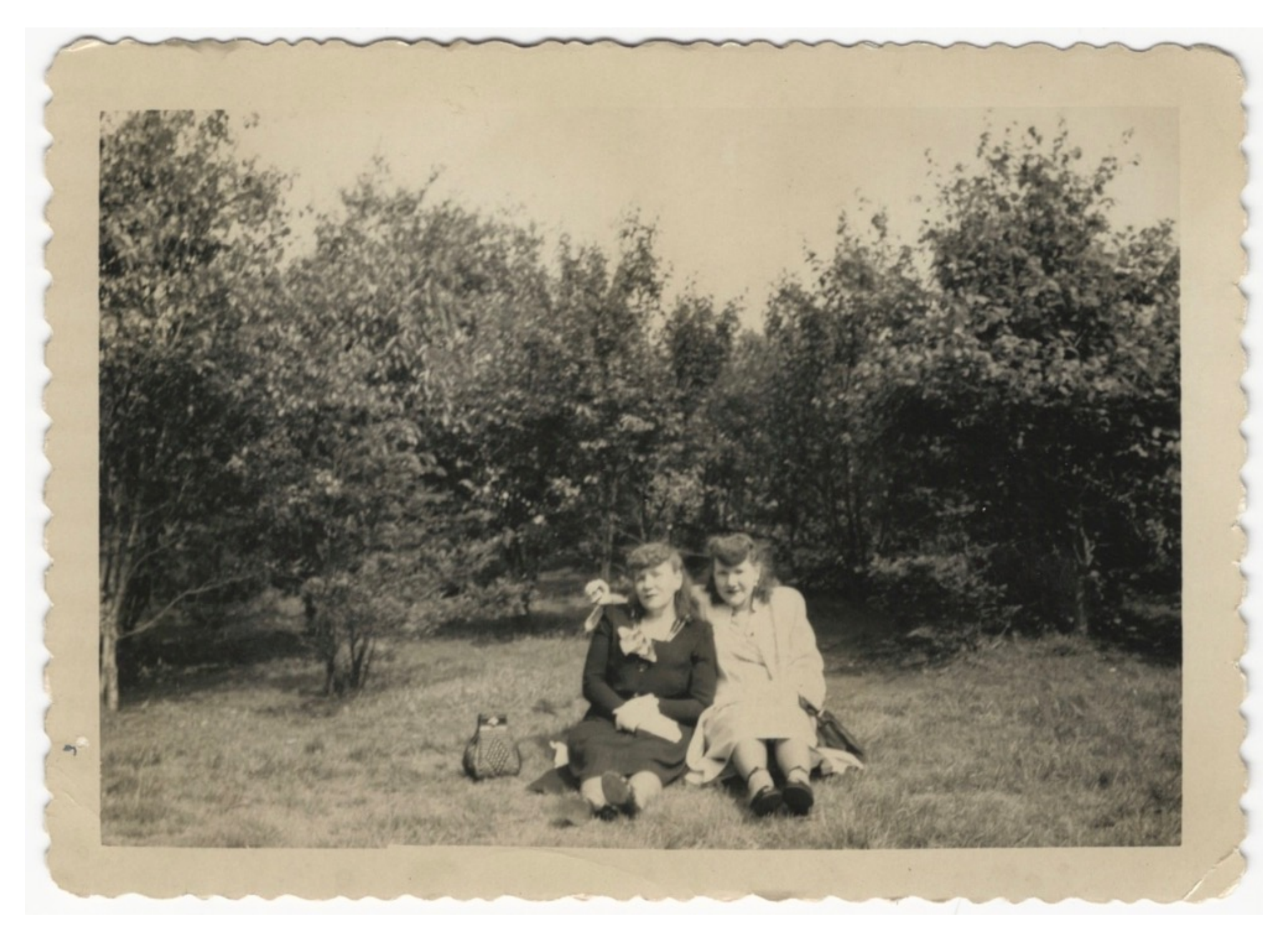
#23. 5"x3.5". $8