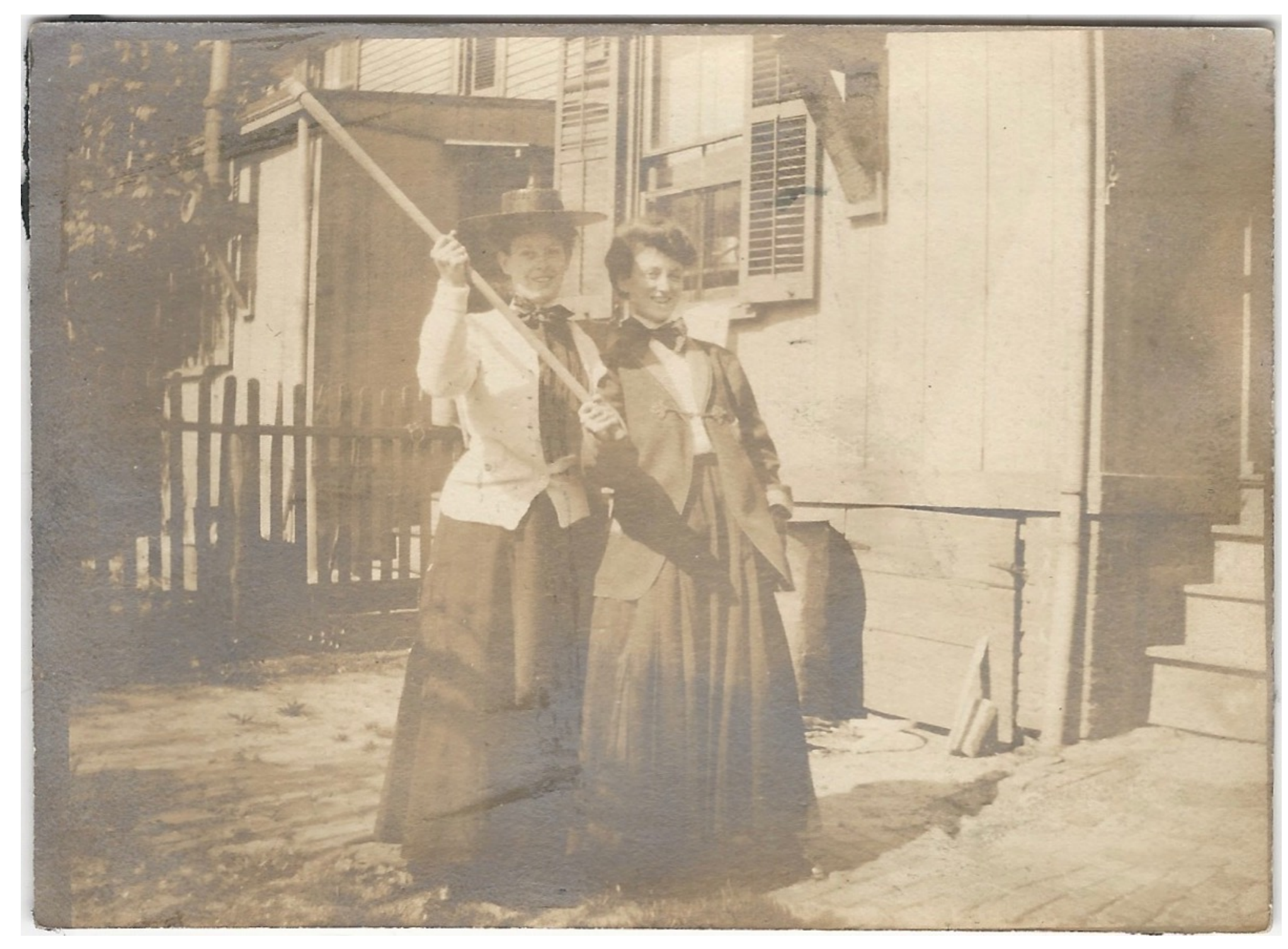
#1. 4.5"x3.25". $8