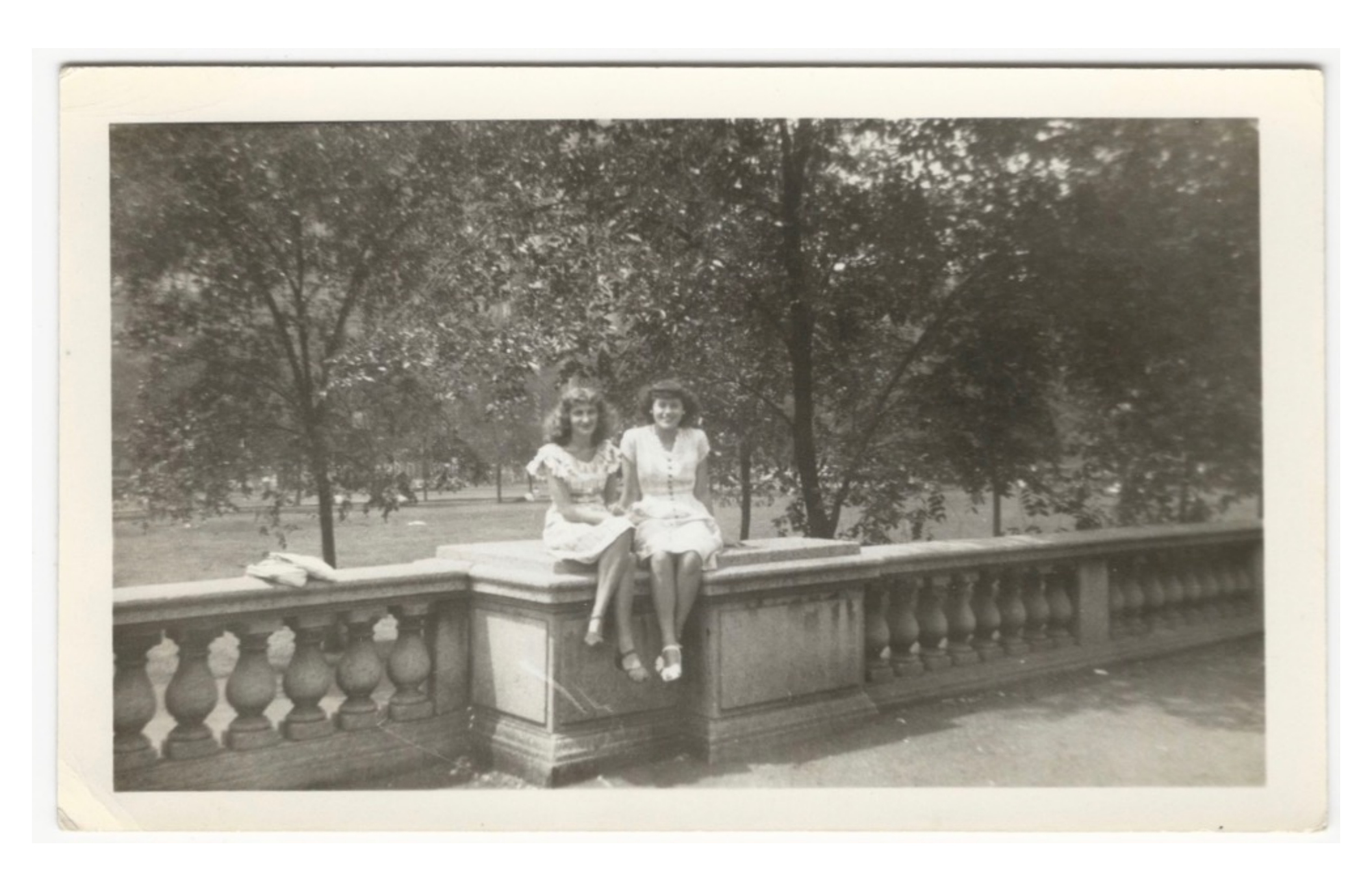
#7. 4.5"x2.75". $8