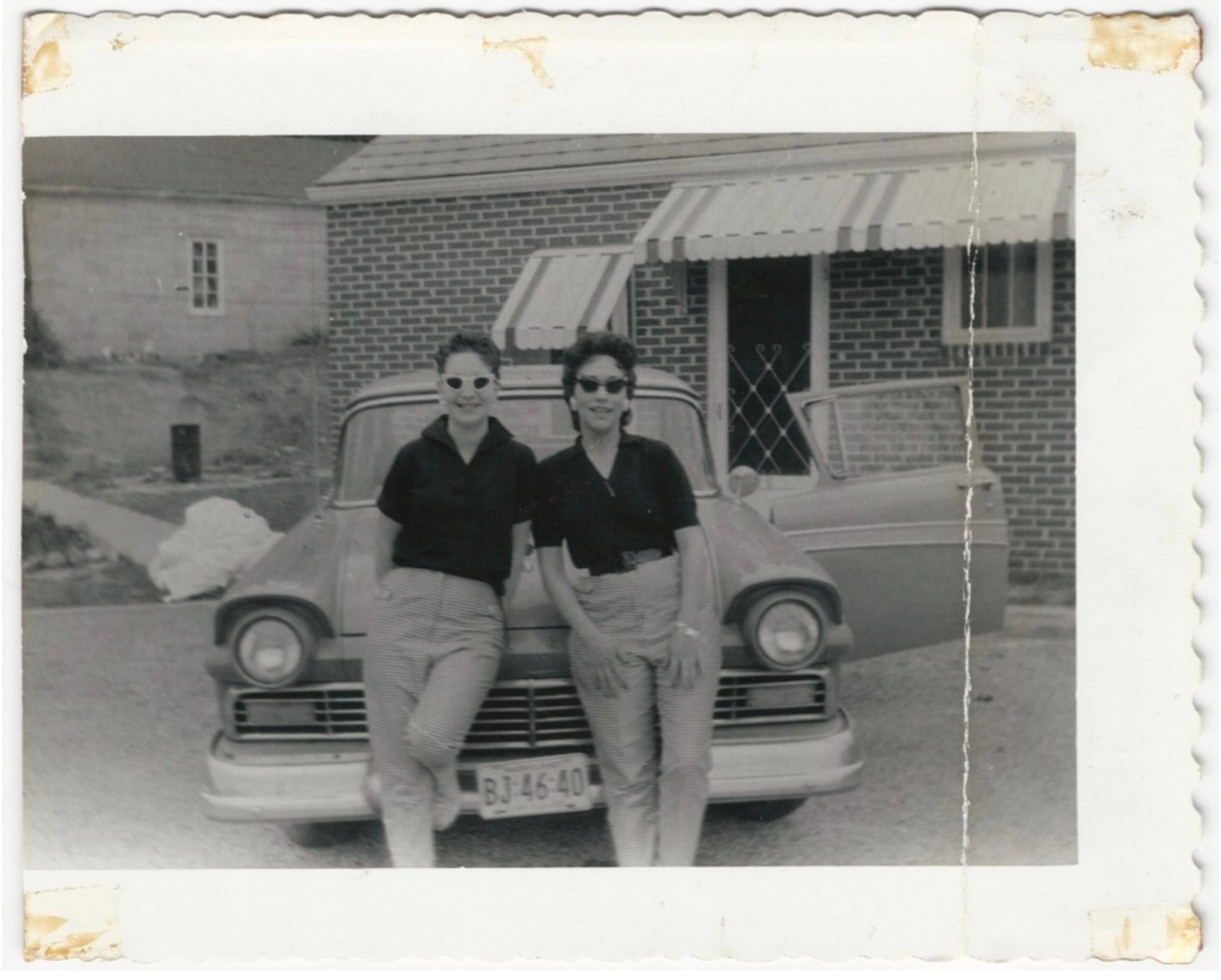
#8. 4.5"x3.5". $8