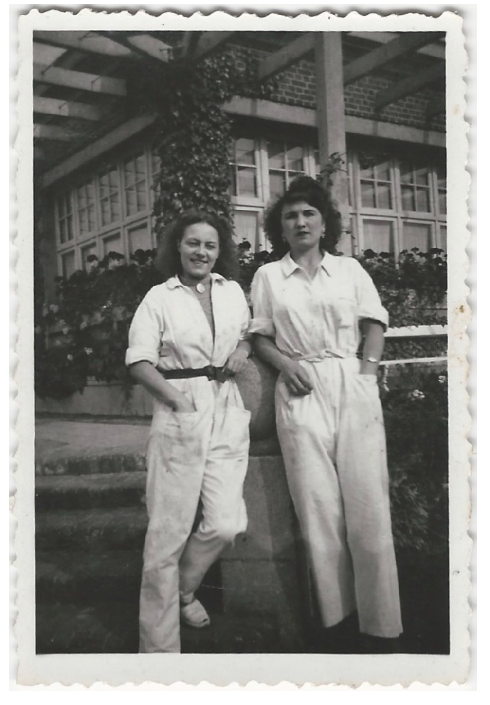
#2. 1.75"x2.75". $8