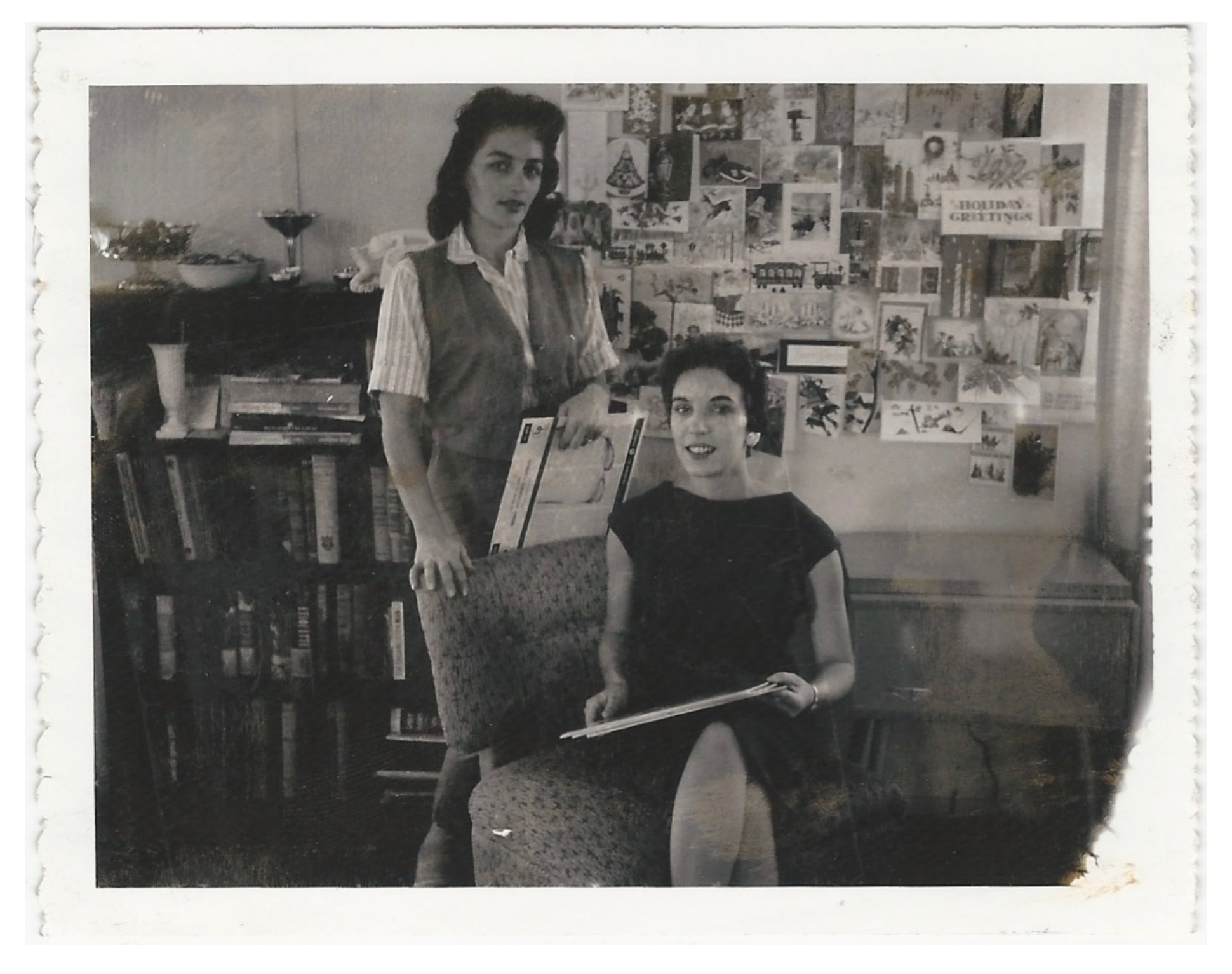
#15. 4.25"x3.25". $8