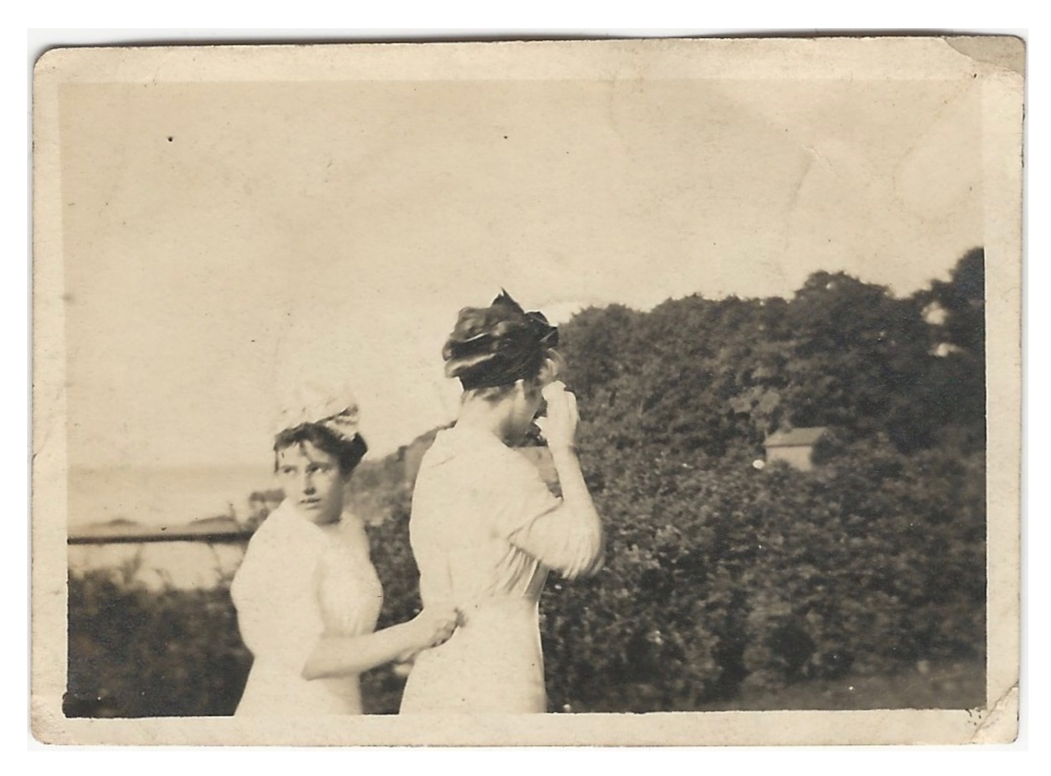
#10. 3.25"x2.25". $8