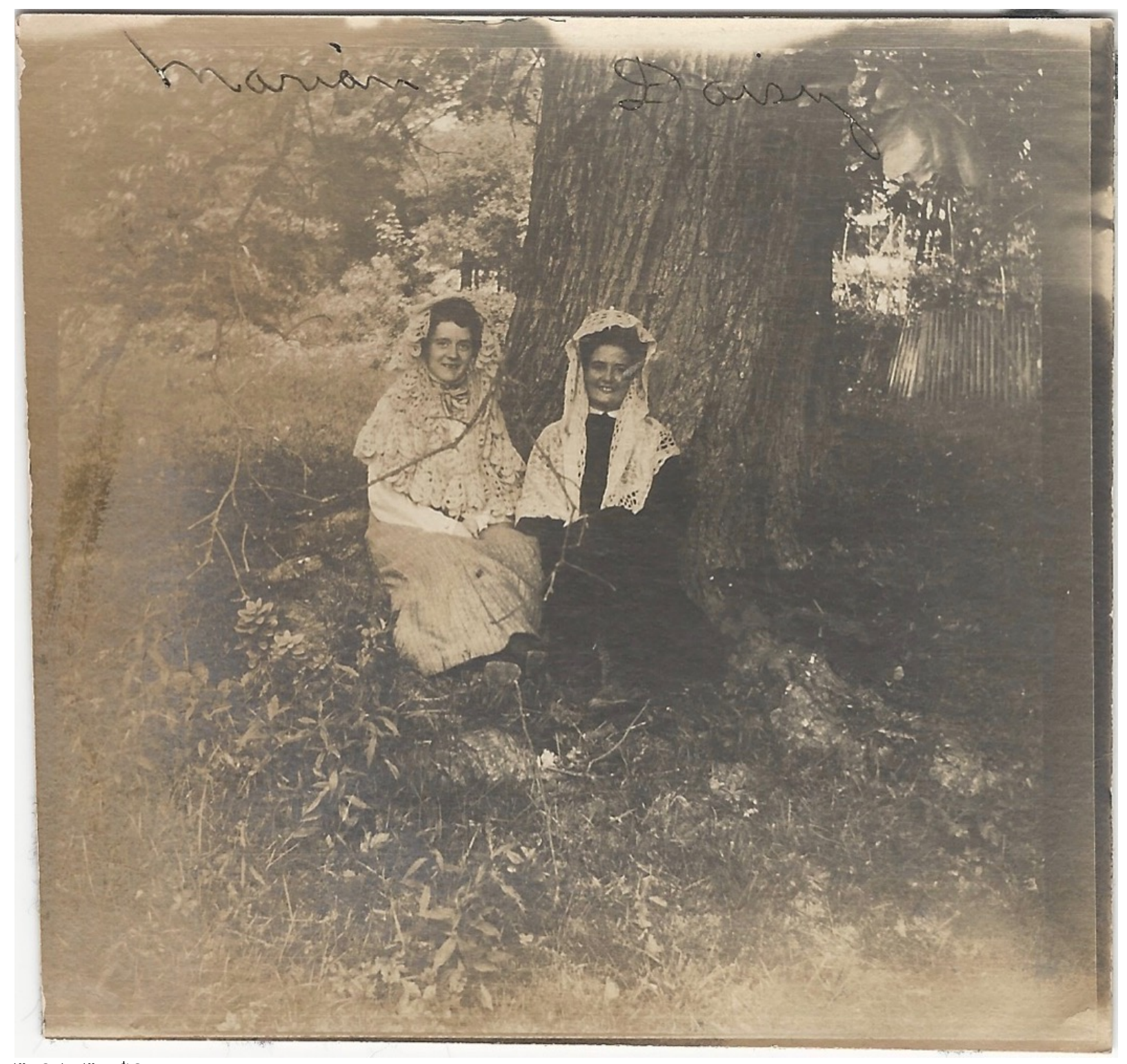
#19. 3.75"x3.75". $8