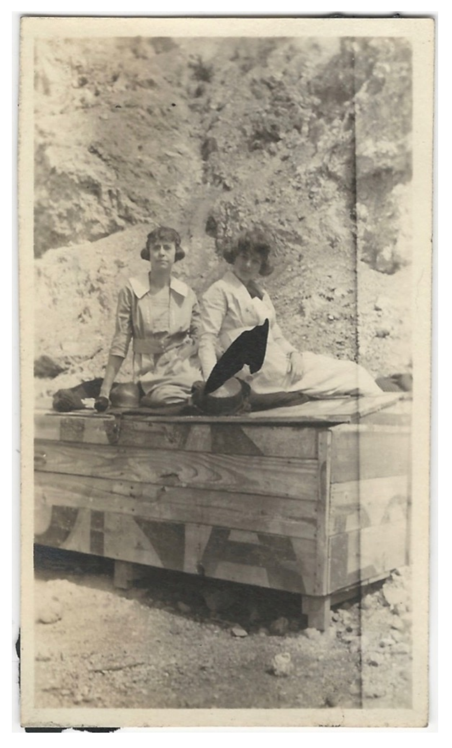
#11. 2.5"x4". (cut-down RPPC) $8